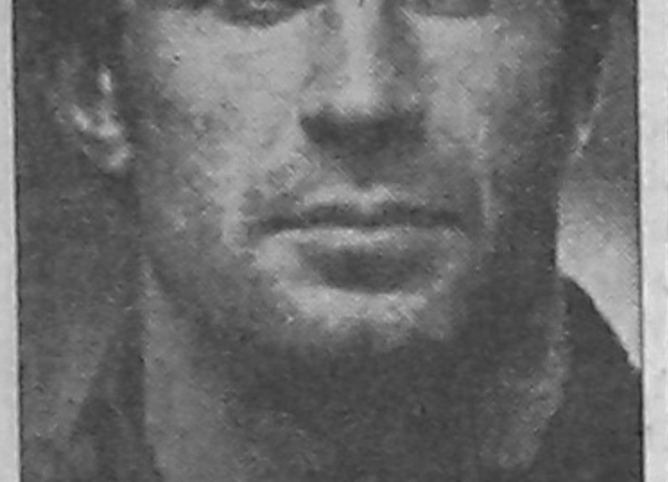
Luis Figo (Portuguese football superstar)

"I hope that I will be as happy as during the years I spent with Barcelona."