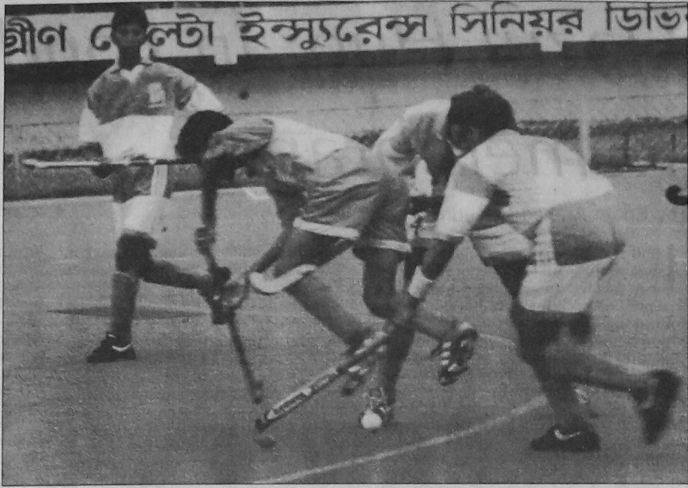
Scene from the Green Delta Premier Division Hockey League encounter between Ajax Sporting and Azad Sporting at the Maulana Bhasani National Stadium yesterday.