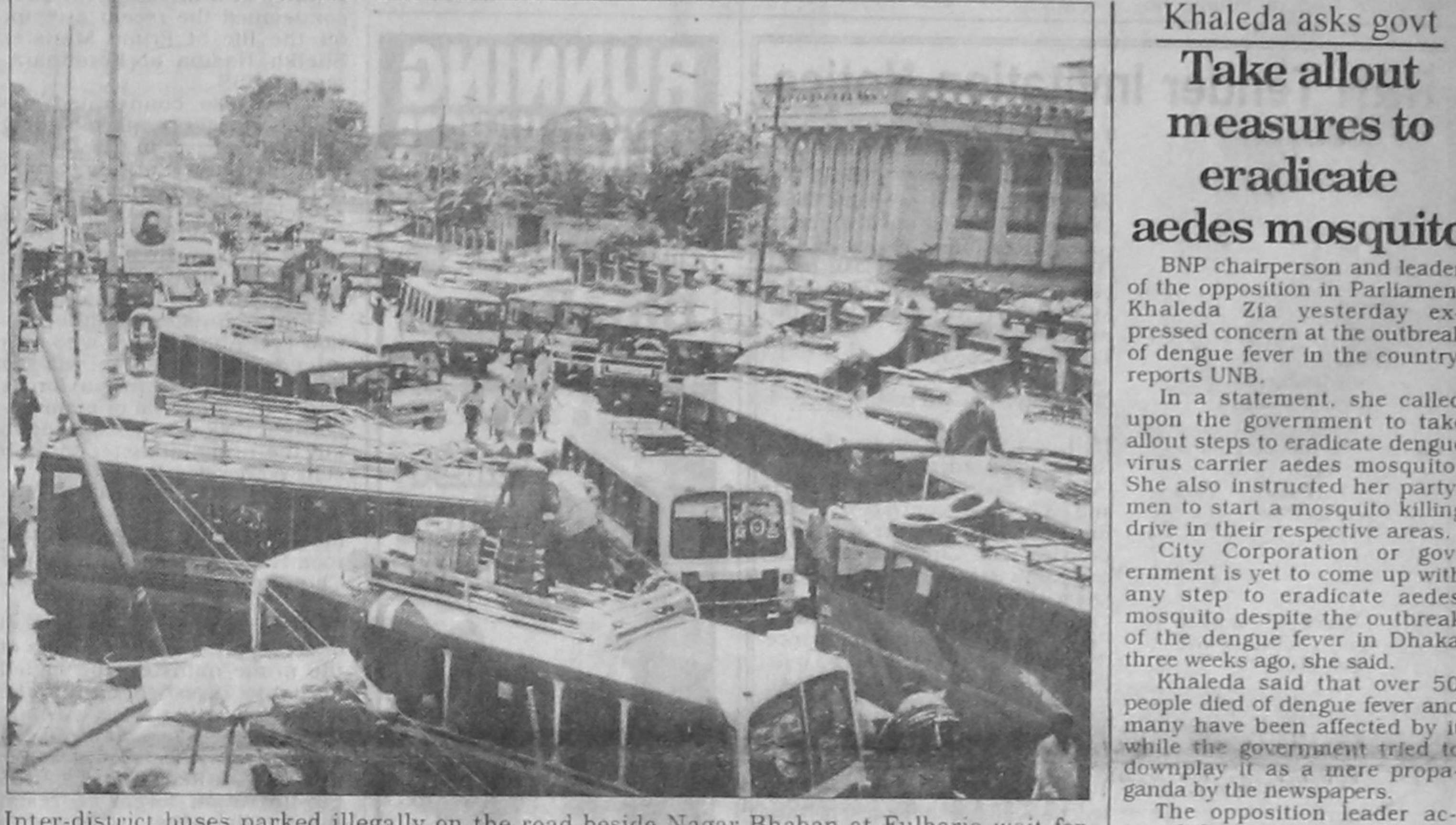
Inter-district buses parked illegally on the road beside Nagar Bhaban at Fulbaria wait for passengers, making traffic congestion in the area all the more worse.