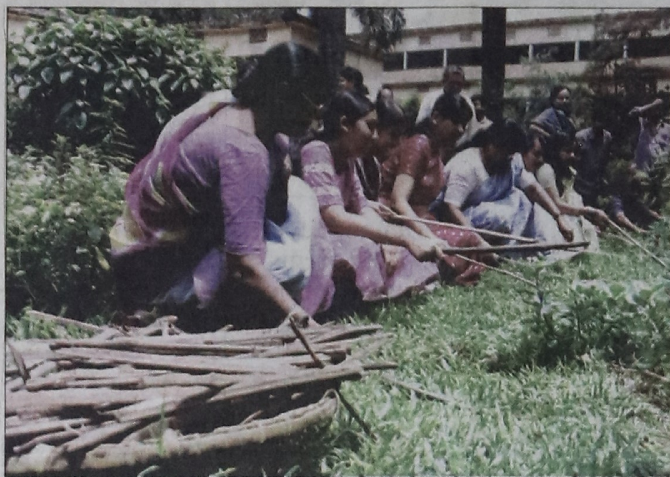
Driven by dengue dread, students and teachers at the Viquarunnisa Noon School and College went for a cleaning drive in and around the campus yesterday.

Published by the Editor from Transact Ltd, 229, Tejgaon Industrial Area, Dhaka-1208 on behalf of Mediaworld Ltd., 52 Motijheel C.A. Dhaka-1000. Editorial, News & Commercial Offices: 19 Karwan Bazar, Dhaka-1215. Telephone Numbers: 8124944, 8124955, 8124966, Fax: 8125155, GPO Box No: 3257, Cable: DAILYSTAR, DHAKA. Internet edition address: http://www.dailystarnews.com and Email address: dstar@bangla.net