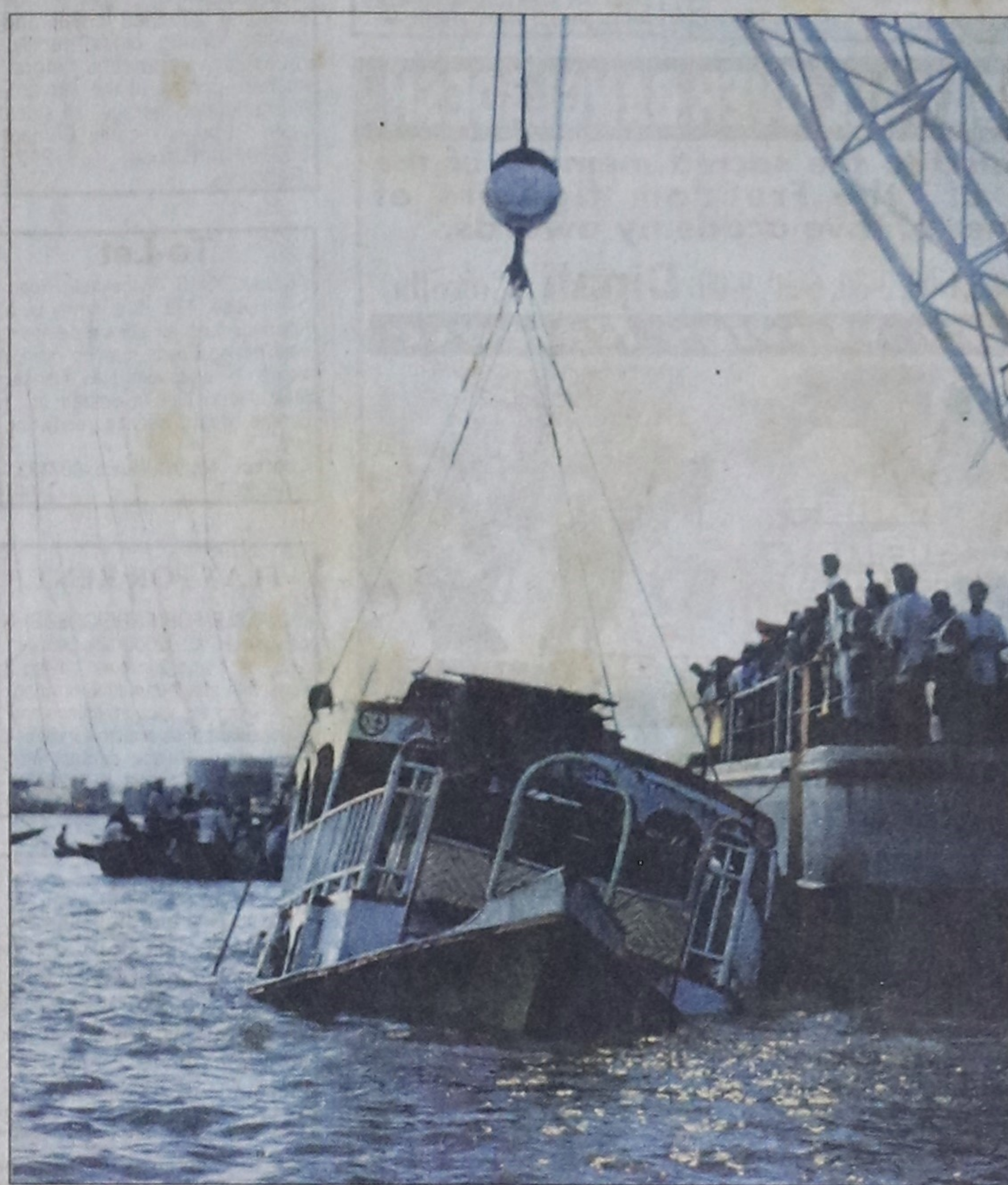
MV Ashique, the hapless Munshiganj-bound launch that capsized in the Buriganga yesterday morning, is being salvaged. Several passengers went missing after the rivercraft was hit and sunk by two racing launches.

But they are escaping punishment due to absence of witnesses, he added. Meanwhile, BIWTA sources said, soon after evacuating passengers, MV Pintu and MV Sagar left the terminal and went to their own docks at the other side of Sadarghat terminal.