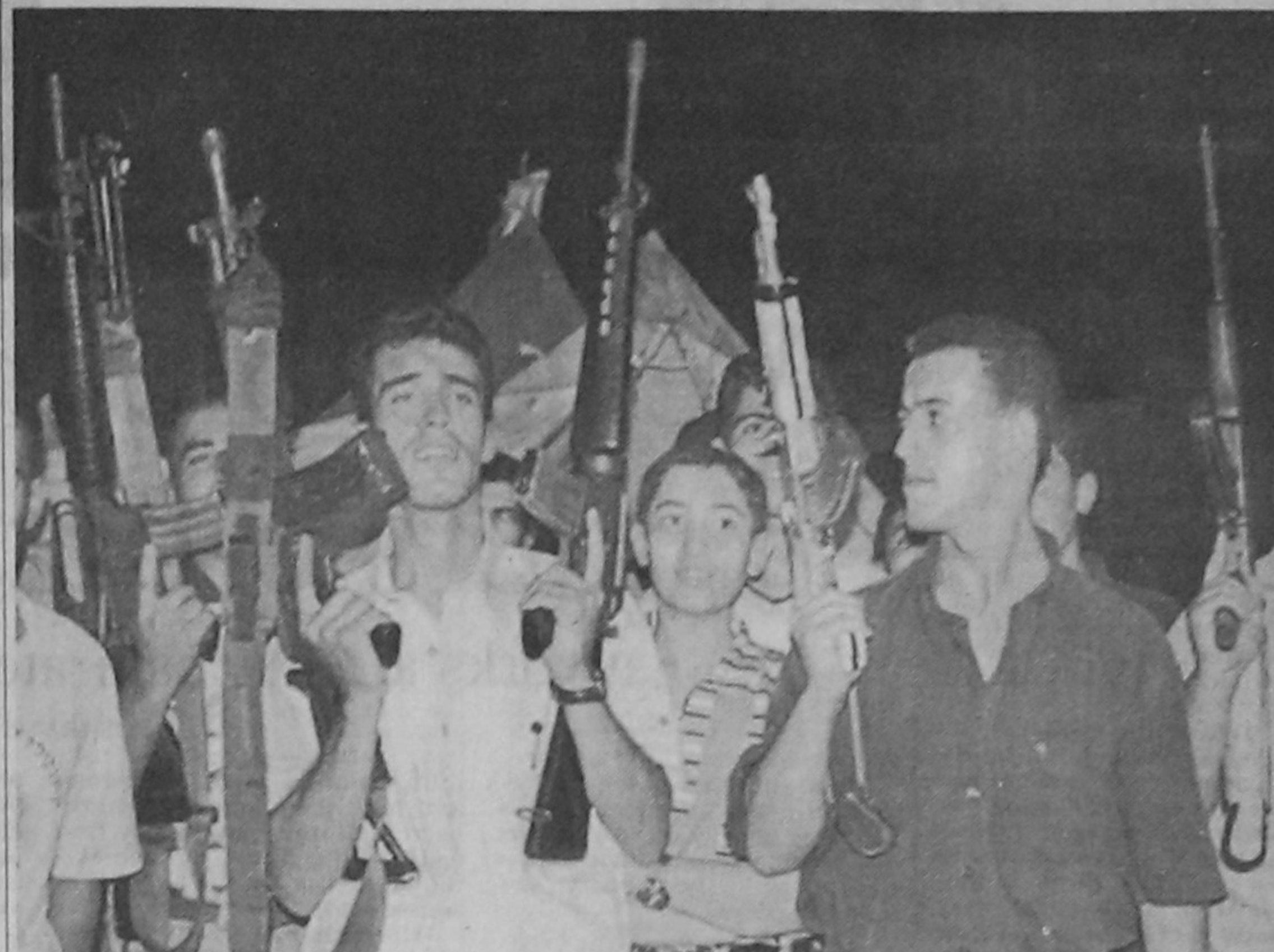
Palestinian protesters wave their guns during an anti-Israel demonstration held in the West Bank town of Nablus on Tuesday, after the failure of the Israeli Palestinian peace summit in Camp David.

The negotiations should aim at the "formation of a new coalition government acceptable to all parties and endorsed by the international community," he said.