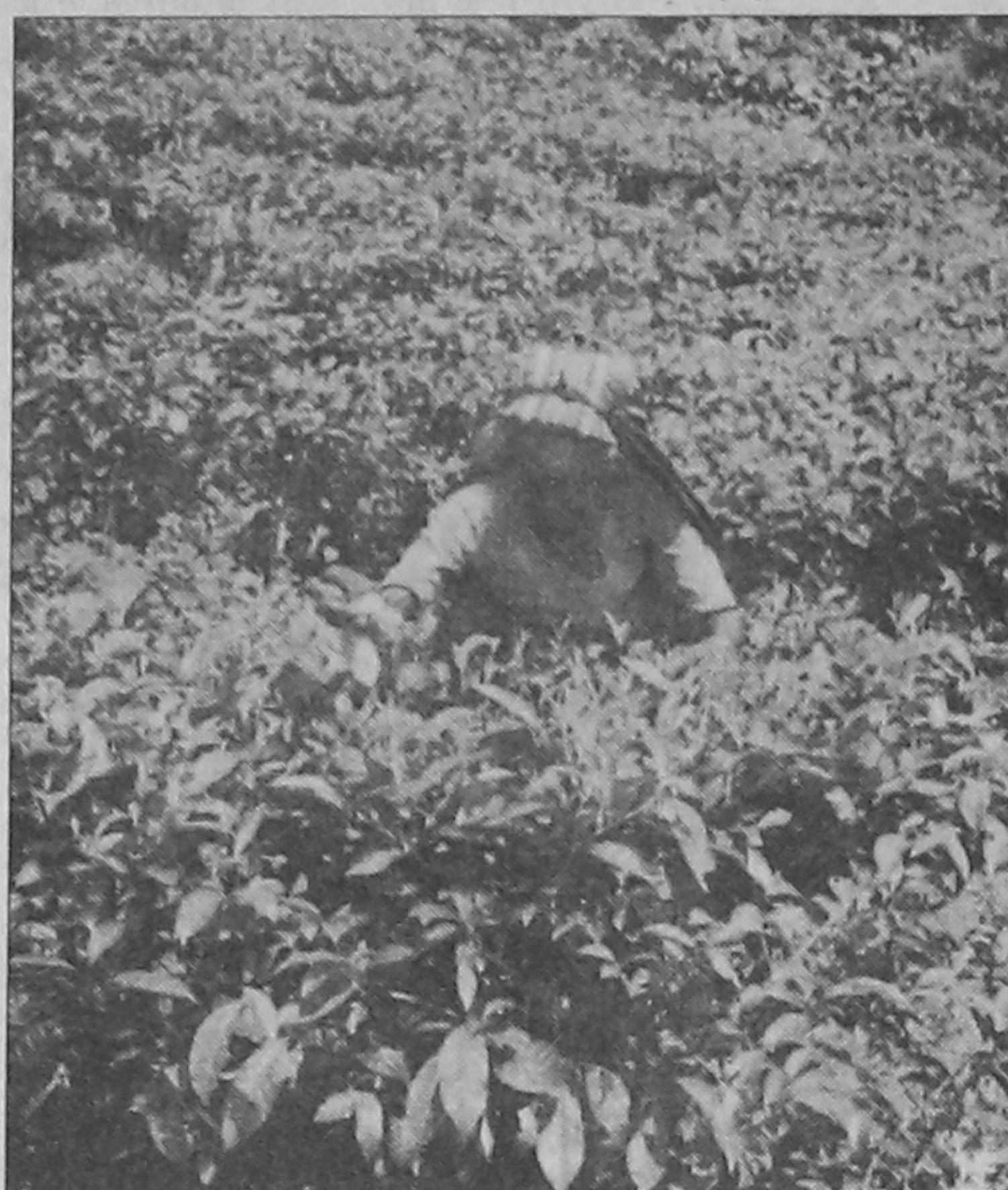
A woman plucking leaves at a tea garden in Sylhet.