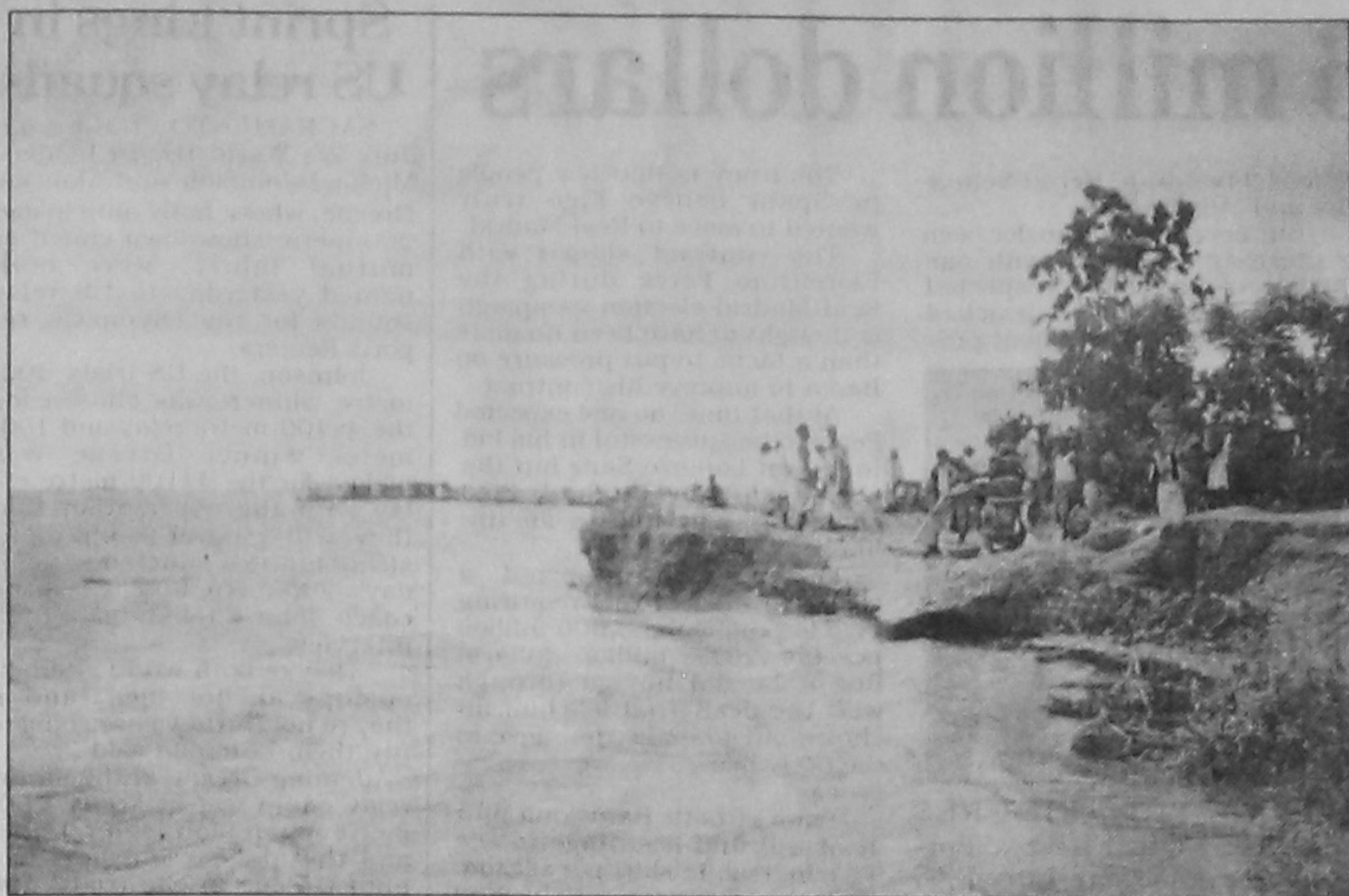
Jamuna erosion takes a serious turn at Shuvagachha village in Kazipur upazila of Sirajganj district. Only 20 houses are left which may go under the riverbed at any time.