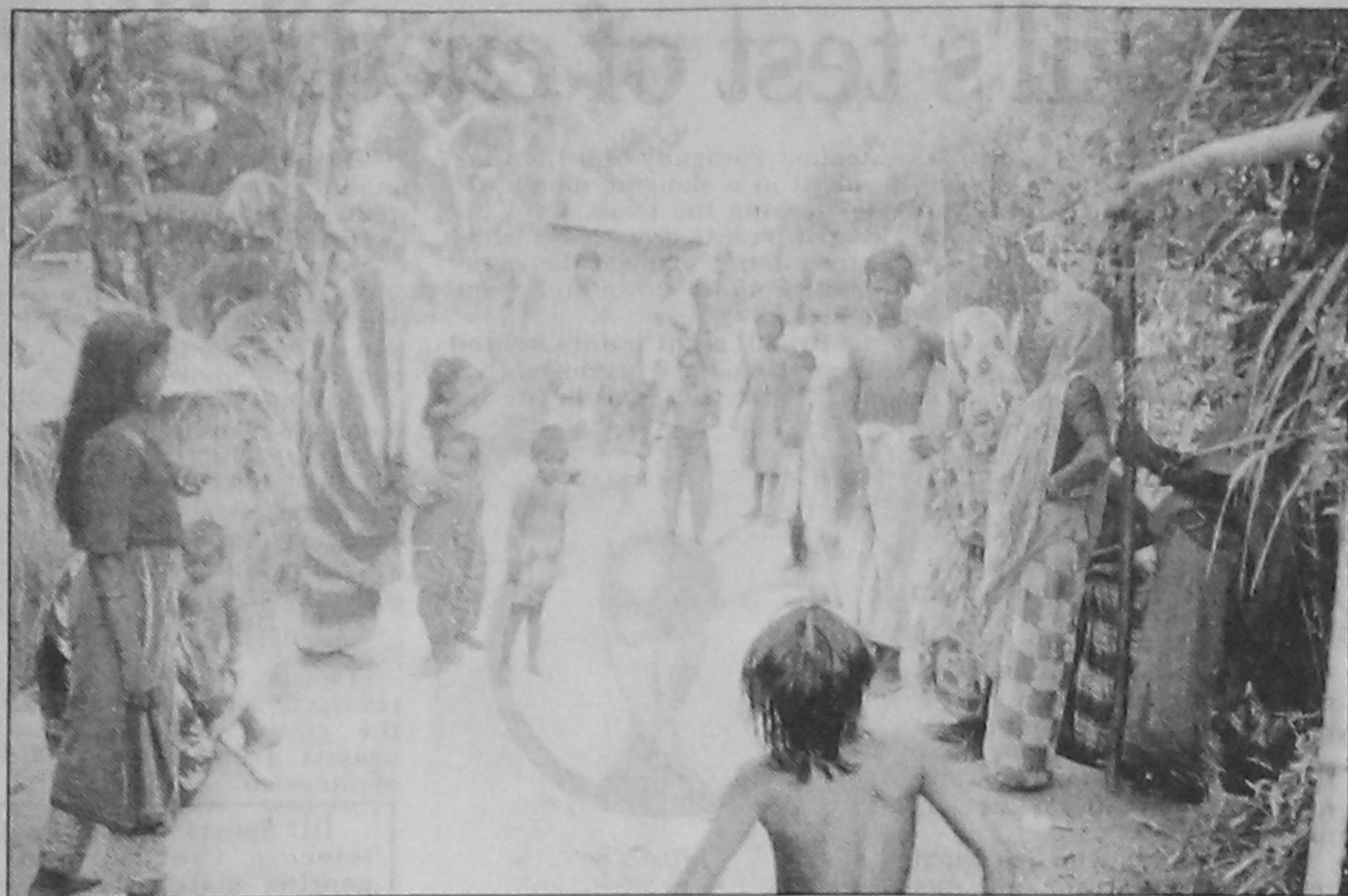
Some ill-fated erosion victims of Sonatoli village, 45-km away from Sirajganj Sadar police station. They are living under the open sky.