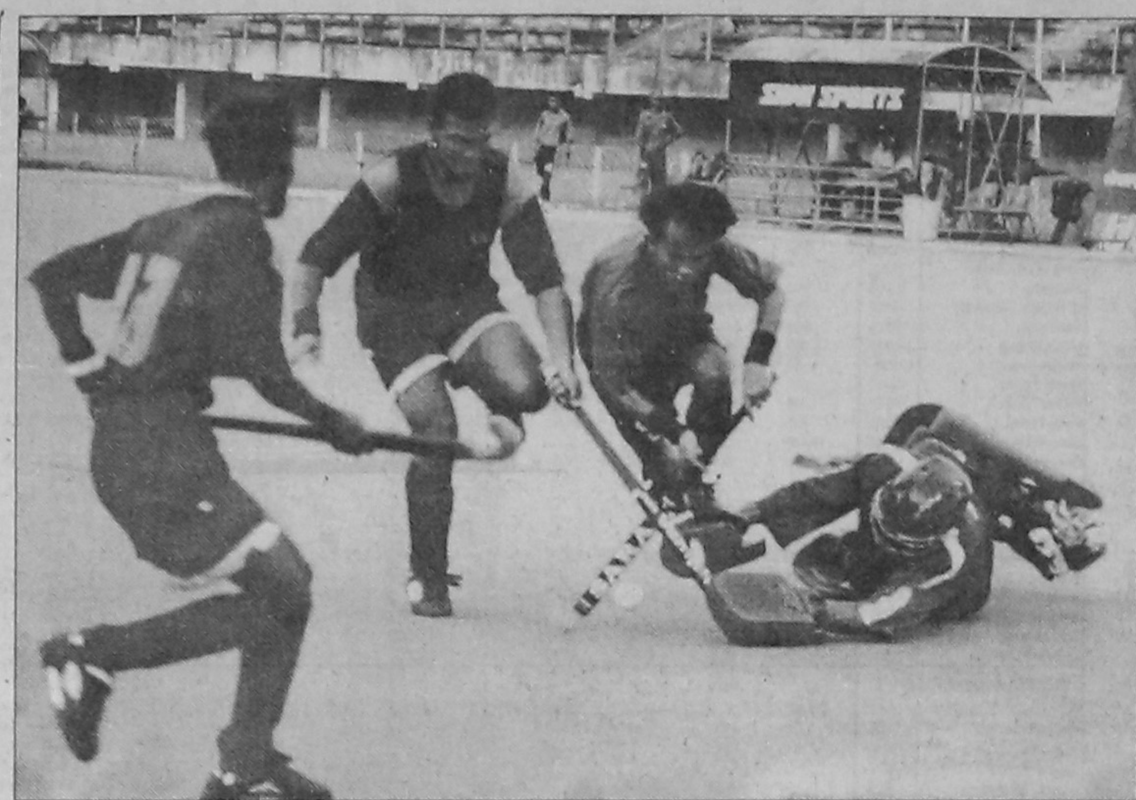
Scene from the Green Delta Premier Division Hockey League match between Mariner Youngs Club and Azad Sporting Club yesterday.