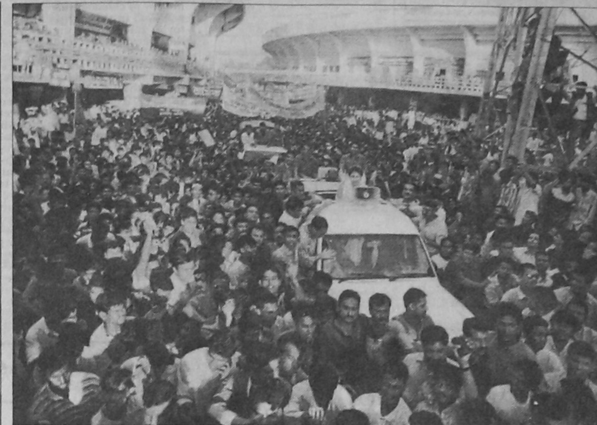
Opposition leader Khaleda Zia led a mass procession which paraded different city streets yesterday.

Earlier, police had so far arrested more than 100 people under Section 54 for their suspicious movement.