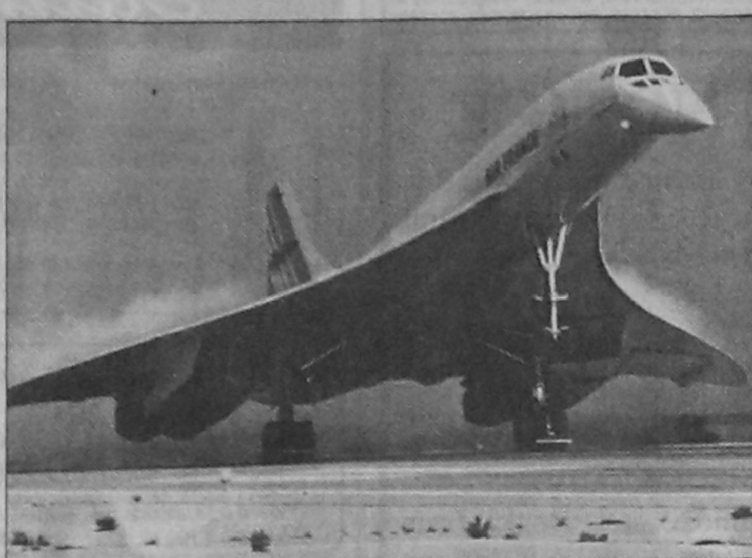
This recent AFP file photo shows a Concorde taking off at Charles De Gaulle airport, near Paris. A Concorde jet flying to New York crashed near the airport yesterday killing all 109 aboard.

PARIS, July 25: An Air France Concorde en route to New York City crashed outside Paris shortly after takeoff today, slamming into a hotel in the town of Gonesse, Air France said, apparently killing all 109 passengers and crew onboard. It was the first time one of the supersonic jets has crashed, reports AP.