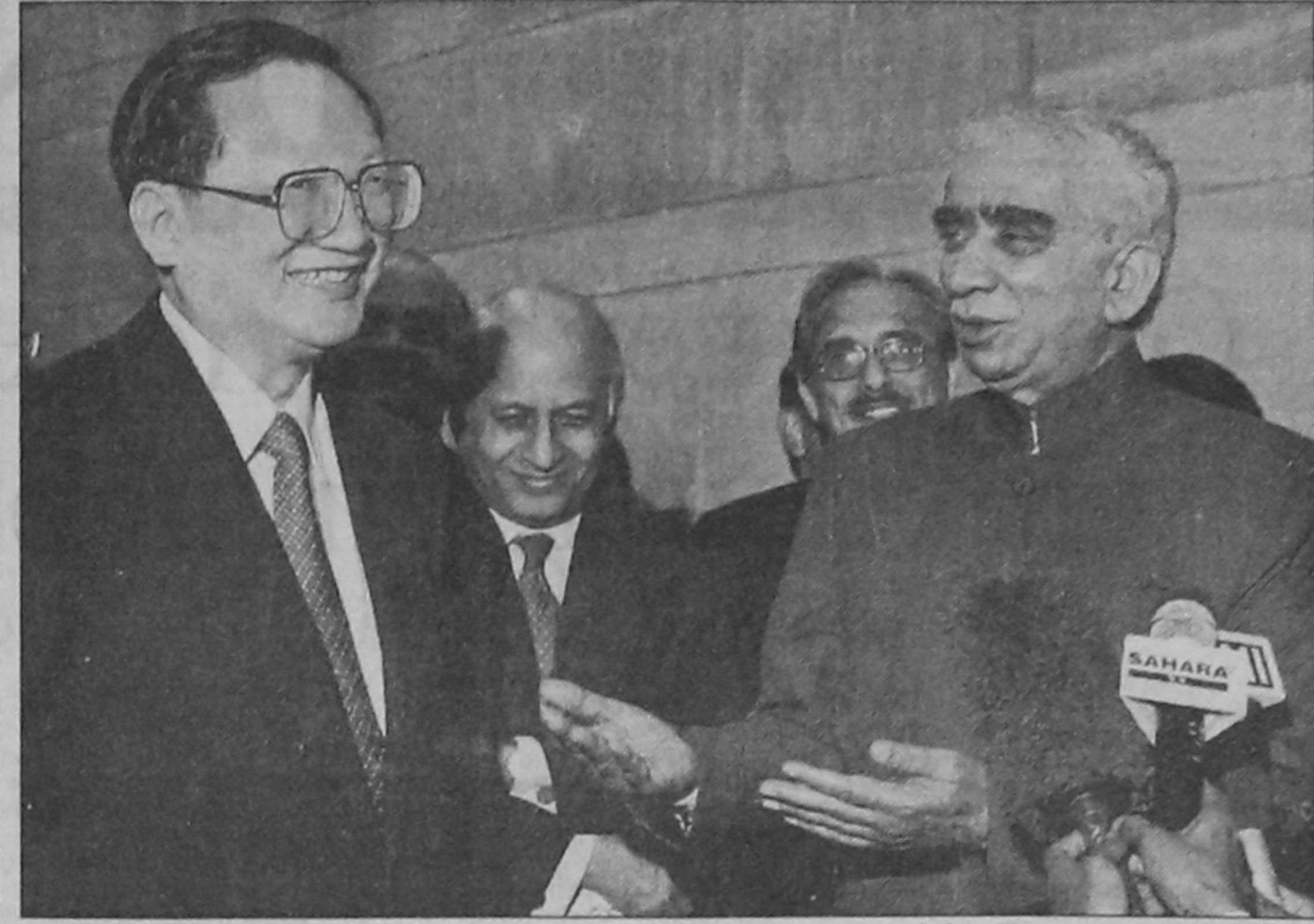
Indian Minister for External Affairs Jaswant Singh (R) gestures towards his Chinese counterpart Tang Jiaxuan as they address reporters during a break in talks at the Foreign Ministry yesterday. Tang is the highest ranking Chinese official to visit India since India's 1998 nuclear tests.

After Arafat's rejection of the proposal, which included joint administration of holy places, US mediators offered the idea of freezing a decision on sovereignty over the Old City, according to sources close to the talks.