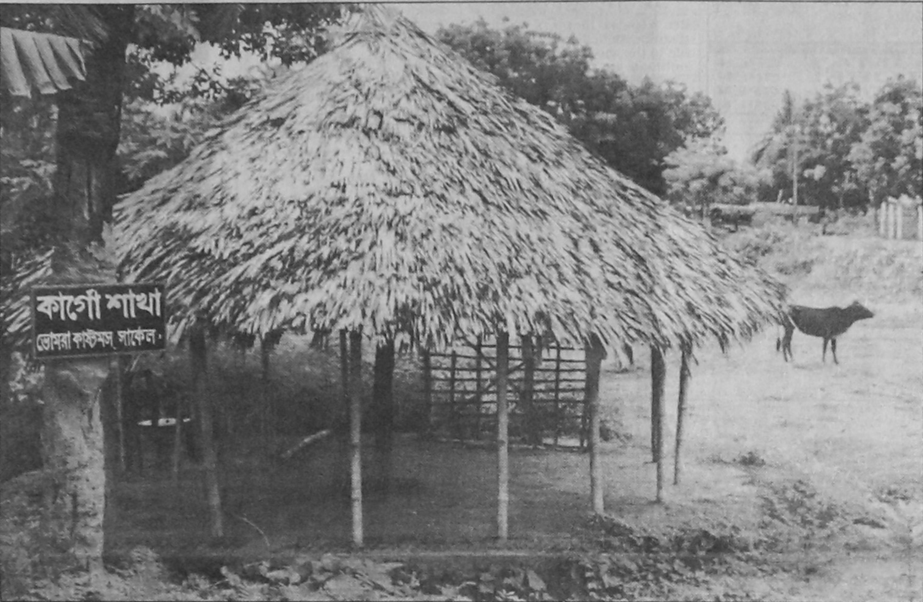
An empty cargo section at Bhomra Land Customs in Sathkira lacks minimum facilities for an office and storing imports like rice, pulse and coal from India. Bhomra is very close to Calcutta by road.