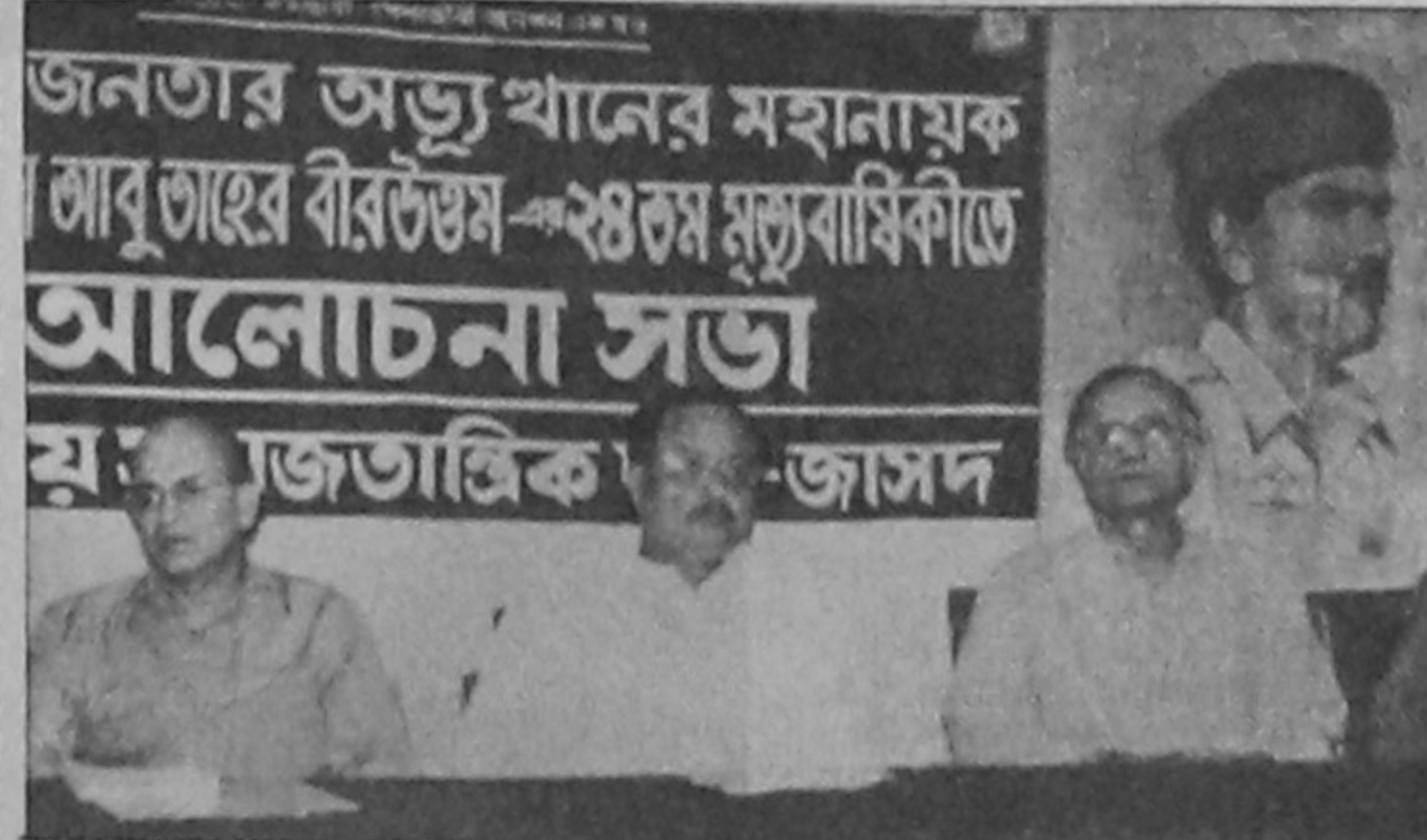
Jatiya Samajtantrik Dal organised a discussion on Col Abu Taher at the National Museum auditorium yesterday to mark his 24th death anniversary.

None was arrested in this connection till filing of this report at 7:30 pm today.