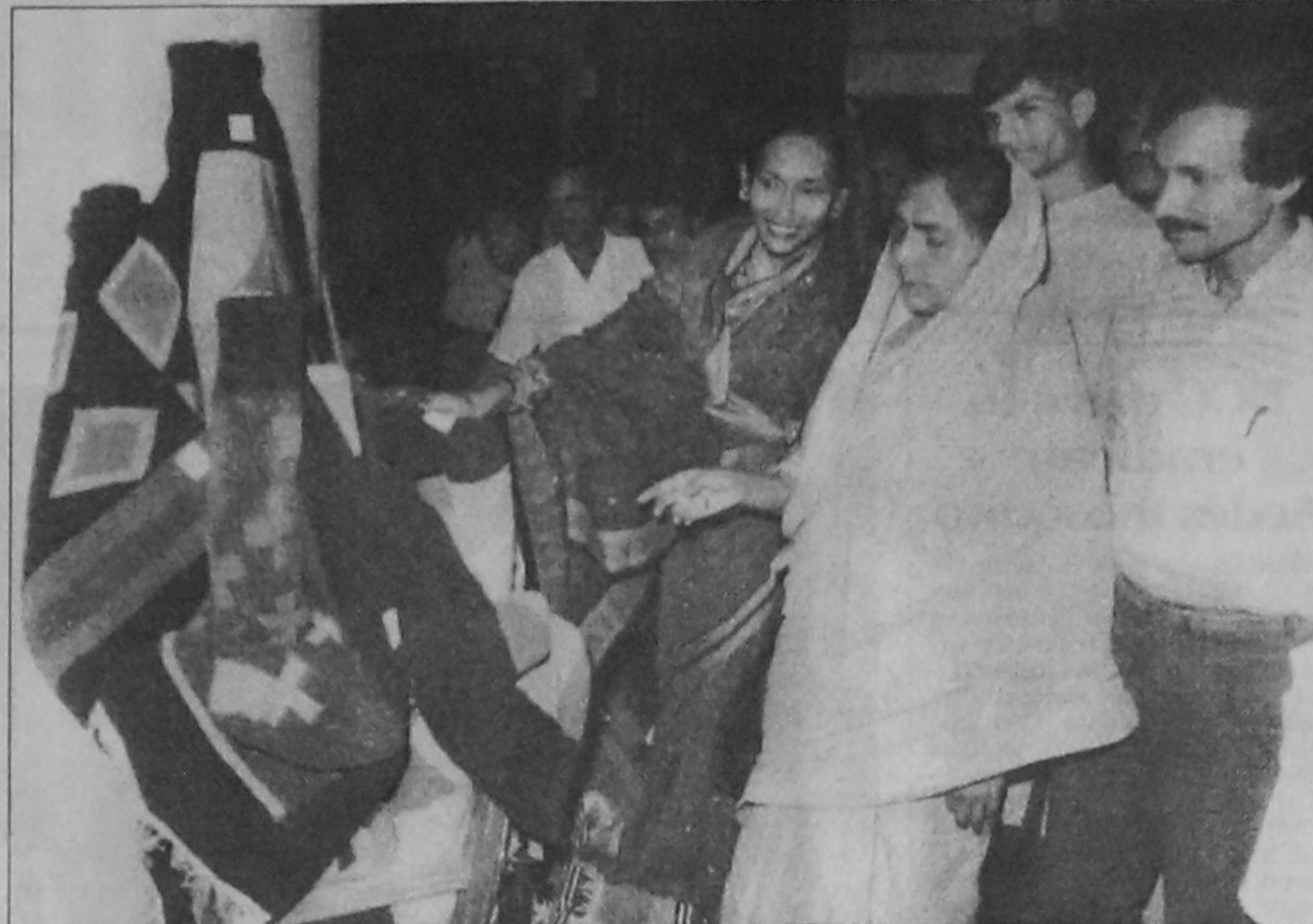
Minister for Agriculture Motia Chowdhury inaugurated an exhibition of Satranji , local traditional carpets, at La Galerie, the new multi-purpose hall of Alliance Francaise de Dhaka in the city yesterday.