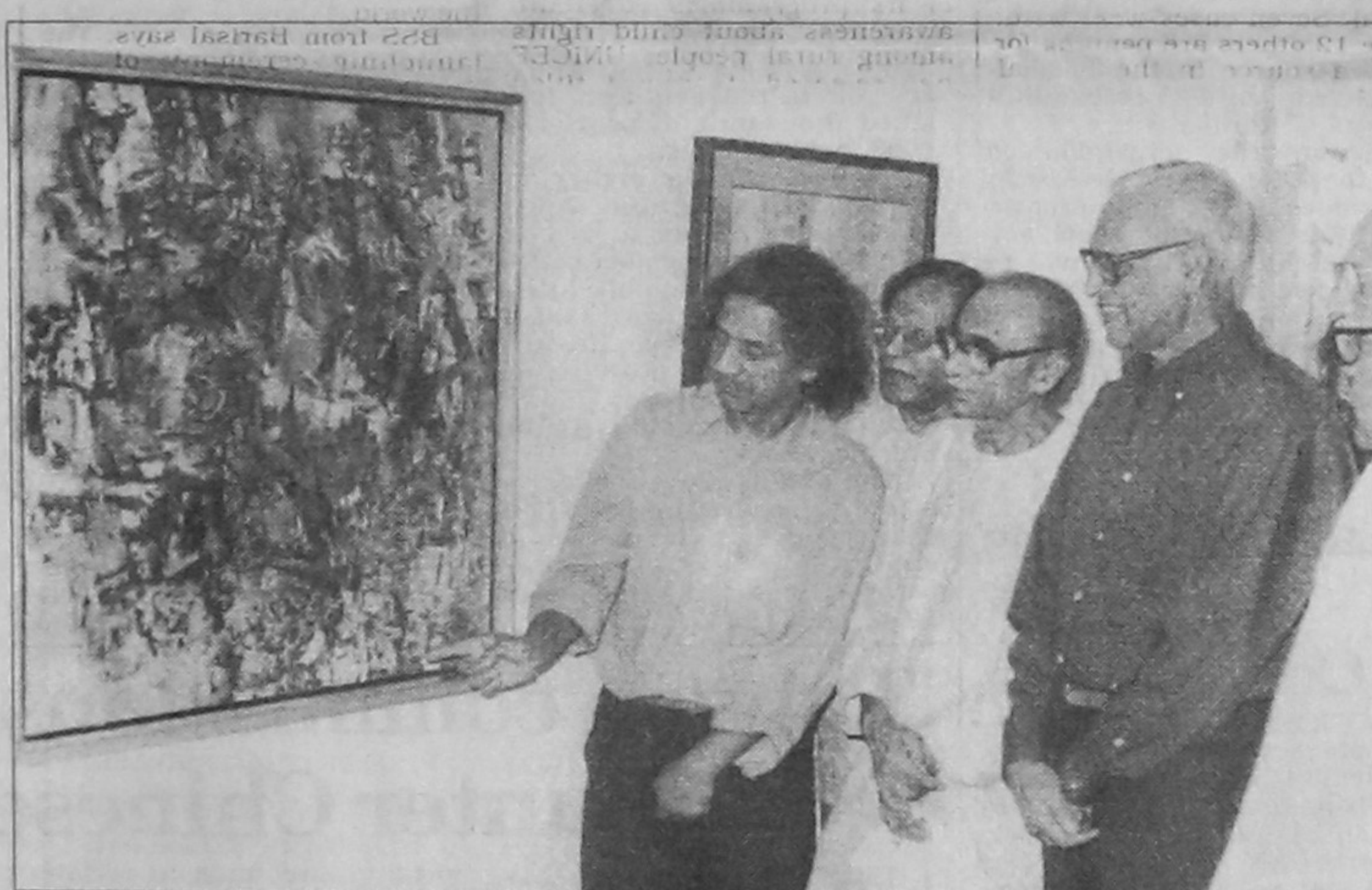
Gallery Chitrak, a centre of fine arts, was inaugurated in the city yesterday with the opening of a 15-day-long painting exhibition of new and old artists.

Besides, the board had sent another project proposal, "Current River Development project", involving Tk 38 crore, to the Ministry. But action on this proposal is too slow.