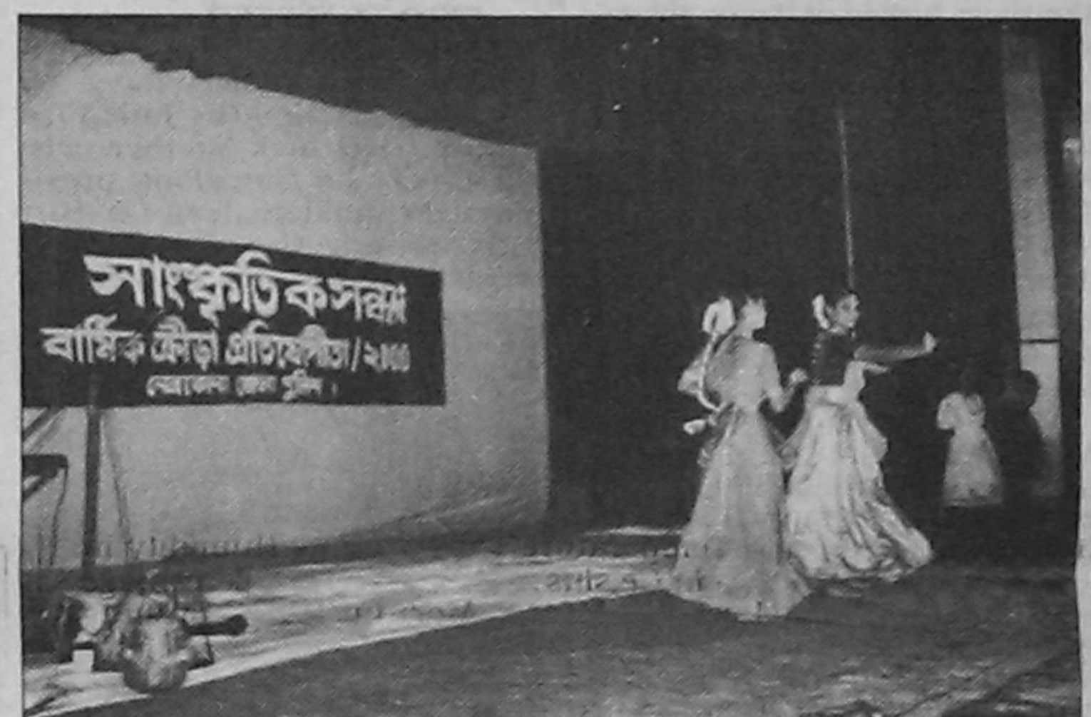
A dance sequence from a cultural show held recently on the occasion of the annual sports meet of Netrakona district police.