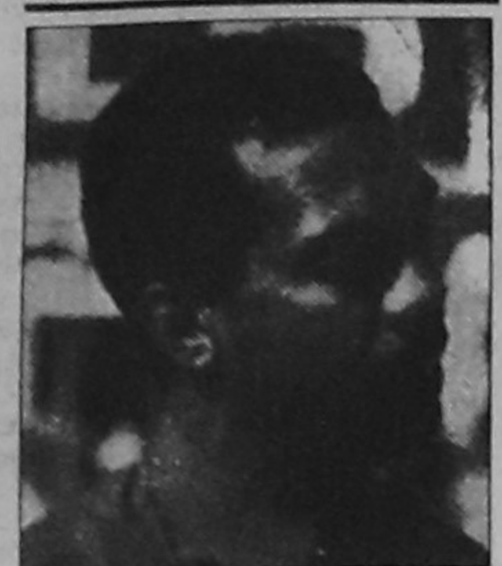
Michael Holding (West Indian fast bowling great) There is not one, but two batsmen who I thought were technically sound and I enjoyed bowling to them — Greg Chappell and Sunil Gavaskar.