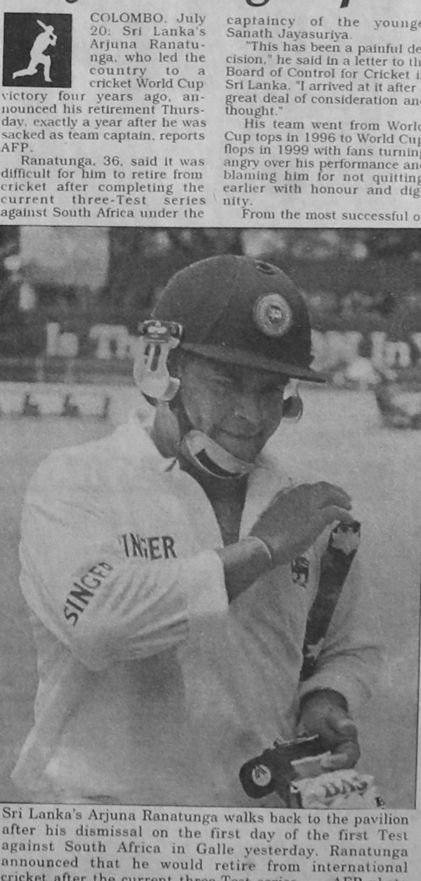
Sri Lanka's Arjuna Ranatunga walks back to the pavilion after his dismissal on the first day of the first Test against South Africa in Galle yesterday. Ranatunga announced that he would retire from international cricket after the current three-Test series.

He scored his country's maiden Test fifty in that game. Since then he has played a