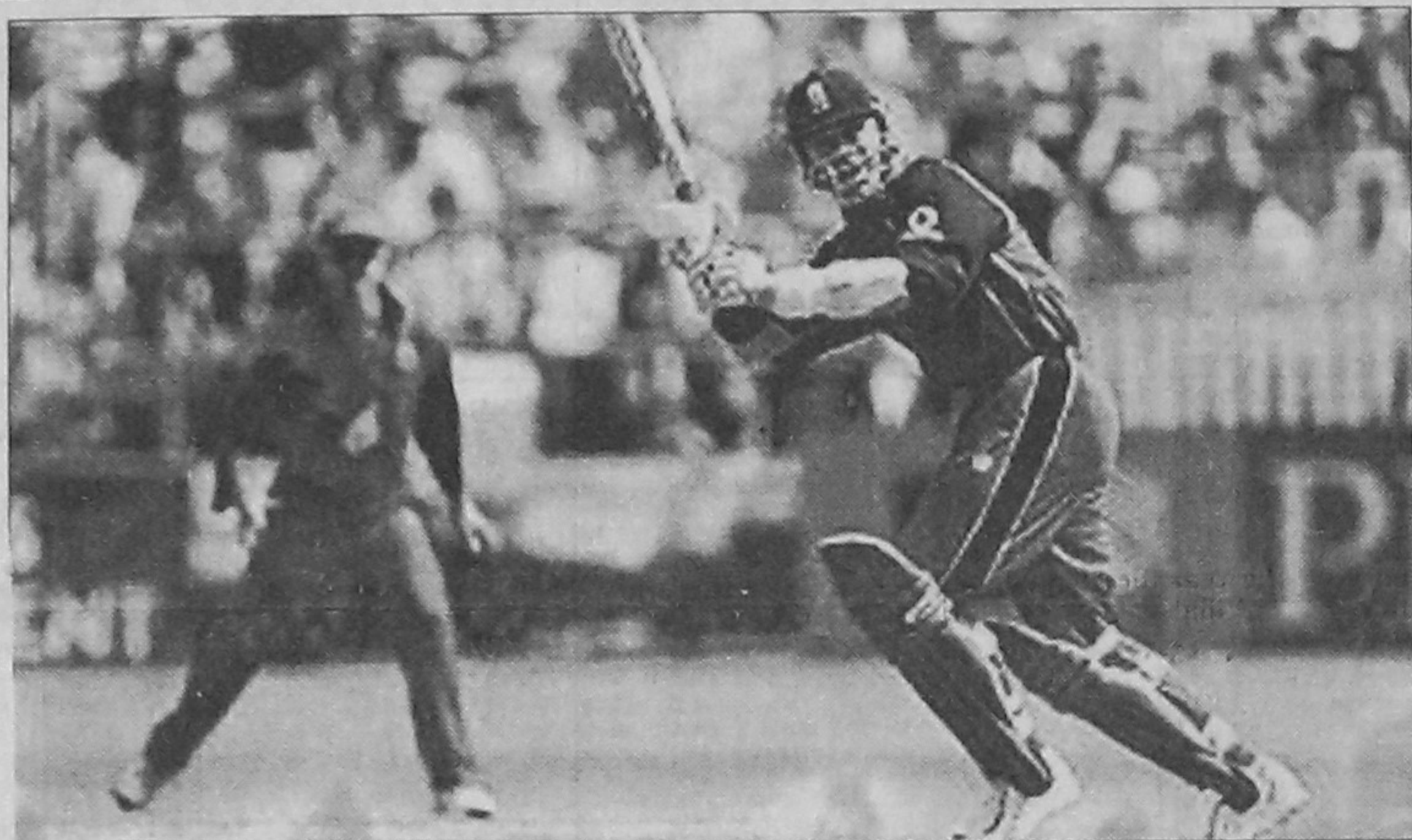
Man-of-the-match Alec Stewart of England flicks during the NatWest Trophy one-day international against Zimbabwe at Edgbaston on July 18.

But the gentlemen in cricket, who thought that the decision would automatically come, are living in fool's paradise. Taking our culture into account, one can say cricketers are destined not to get the venue that was once built exclusively for cricket.