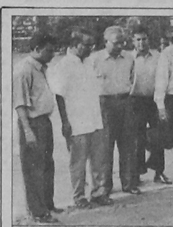
State Minister for Youth and Sports Obaidul Quader kicks the ball to inaugurate the 10th Jadukar Samad youth football tournament at the Outer Stadium on July 18.

All in all, Saturday's final could be carrying plenty of emotion on its back.