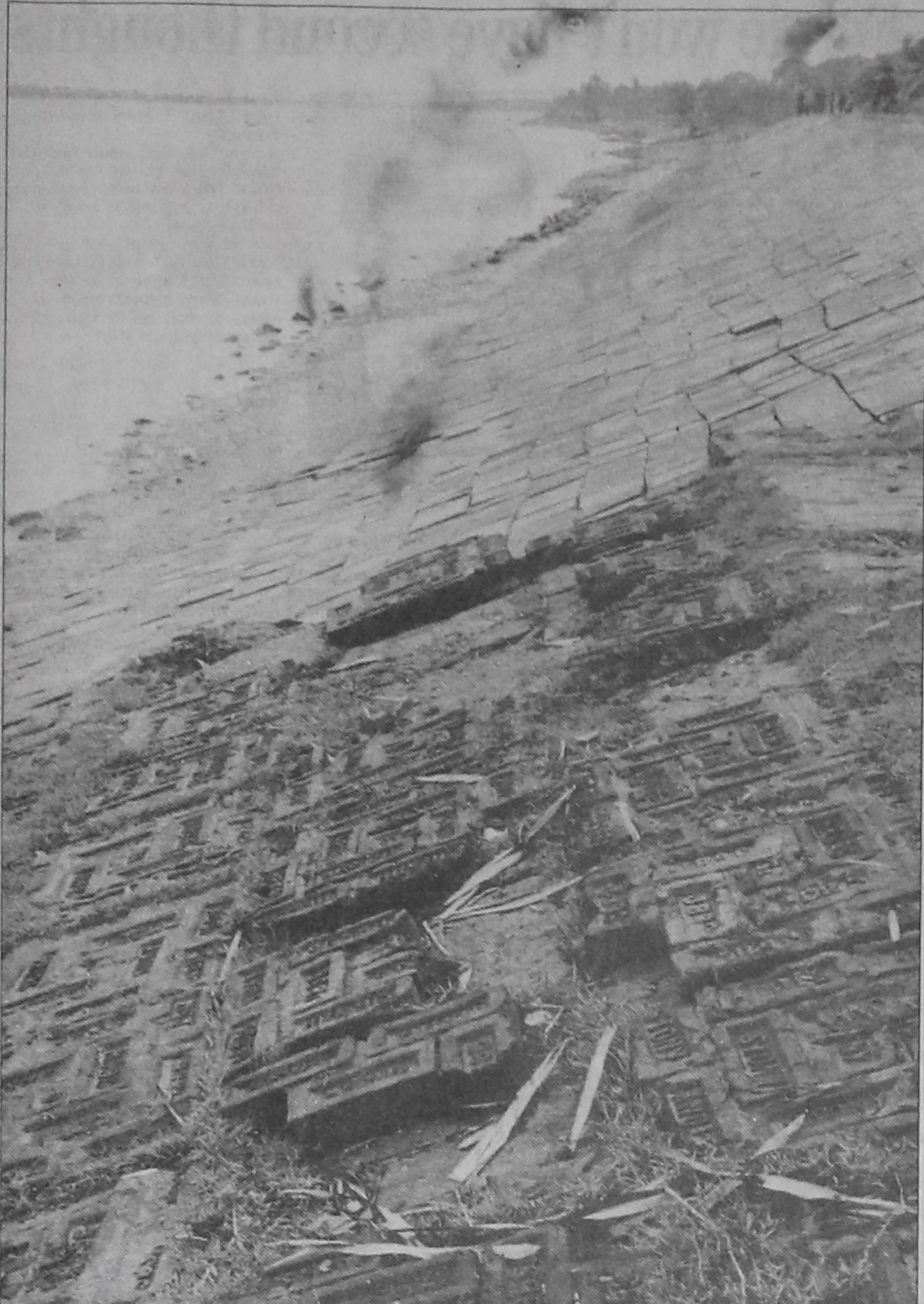
Fortune at the cost of people's money: Satkhira is an erosion prone district. Every year hundreds of families become homeless due to the wrath of the River Ichhamoti. Efforts are being made by the Water Development Board authorities to check erosion by the river. Crores of taka are being spent every year for the purpose, but due to below standard work the hard earned money of innocent people are lost entirely. Photo shows bricks of the embankment along the Ichhamoti has been falling down just after completion of its work.

Local elite urged the government to stop leasing the government khas land at the same mouza of the forest to stop illegal occupation.