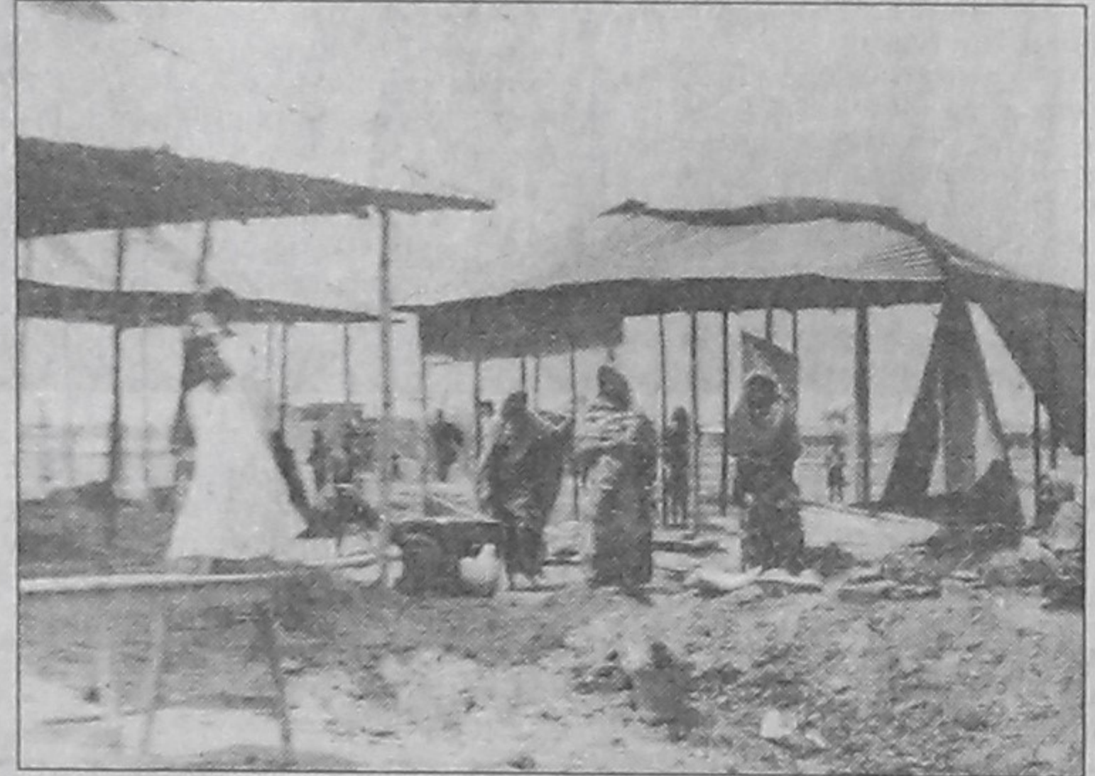
Land grabbing: Some damaged houses of landless settlers.

The victims are very much worried observing the indifferent attitude of police. They are suspicious about their punishment.