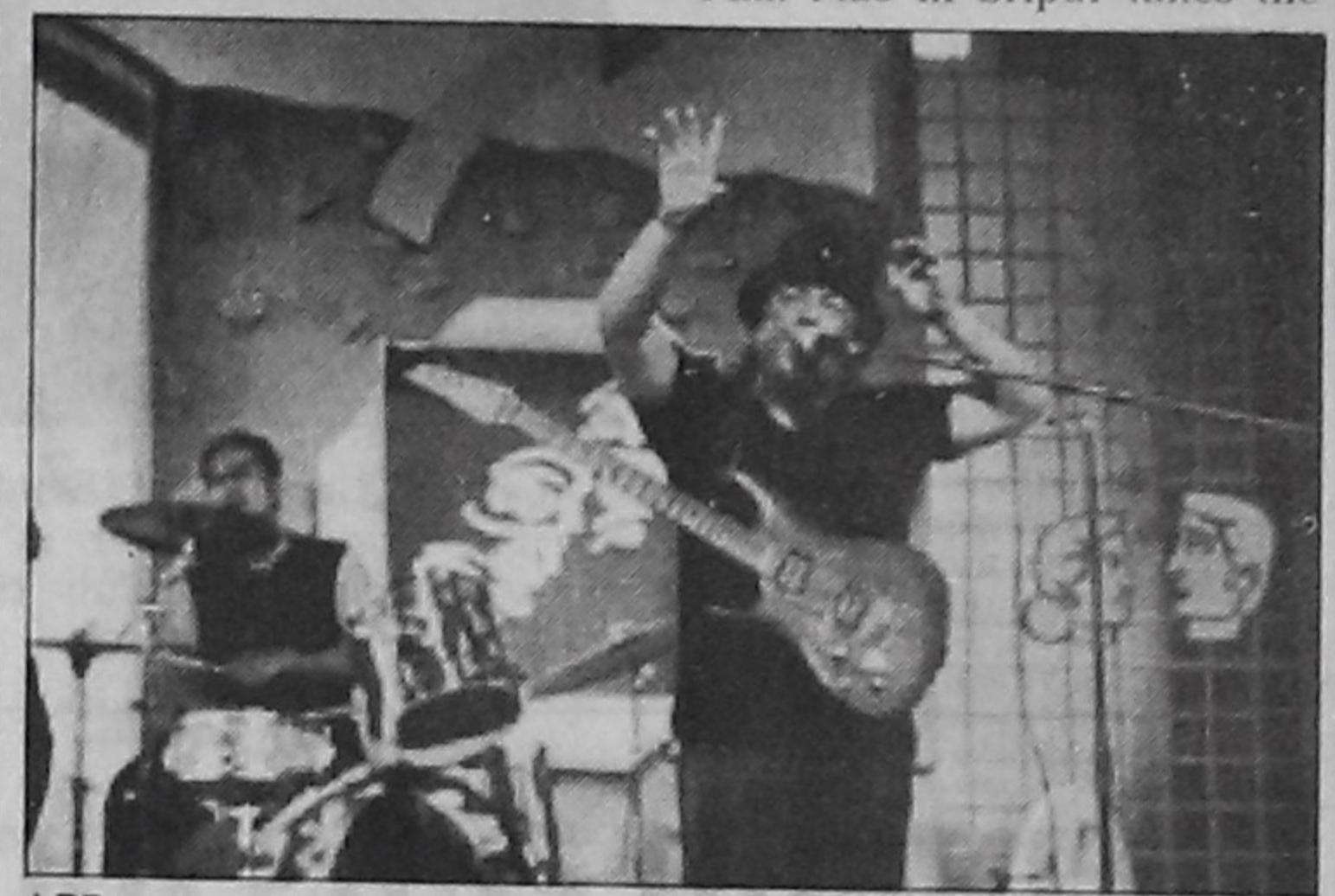
LRB performs their latest number in Kichu Kichu Kotha

In the documentary section, a comic show on Doyel will be presented. The most important part of the show presents us with a tragic documentary on child smuggling and abduction. The story of Mauna Shishu Palli Plus in Sripur takes the