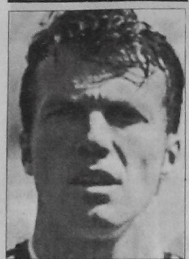
Lothar Matthaeus (German soccer ace) "We really have to take a long hard look at the players' character." Blasting his German teammates' lack of character at the Euro 2000.