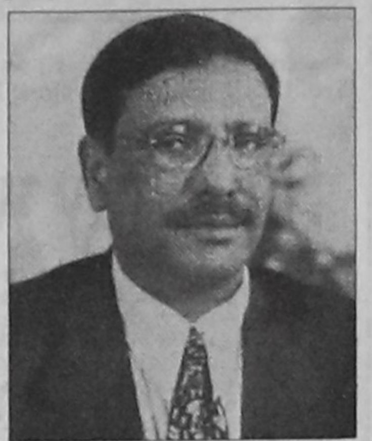
OBAIDUL QUADER spite being informed in advance. The stadium will be built on 6.72 acres. It will have a seating capacity of around 21,000 including a three-storied VIP enclosure. The ground will be ready for use by June next year. But the venue, fourth in the capital, will require more time to complete.

The sensational statement of the sports supreme, hot on the heels of Bangladesh Football Federation's (BFF) outright rejection of possessing the number one National Stadium from July 15 to September 30, has only turned the situation from bad to worse. Surprisingly silent in the face of angry football organisers, who have demanded his resignation, Quader suddenly took the attack to his critics during his visit at the under-construction football stadium at Mughdipara in the city.