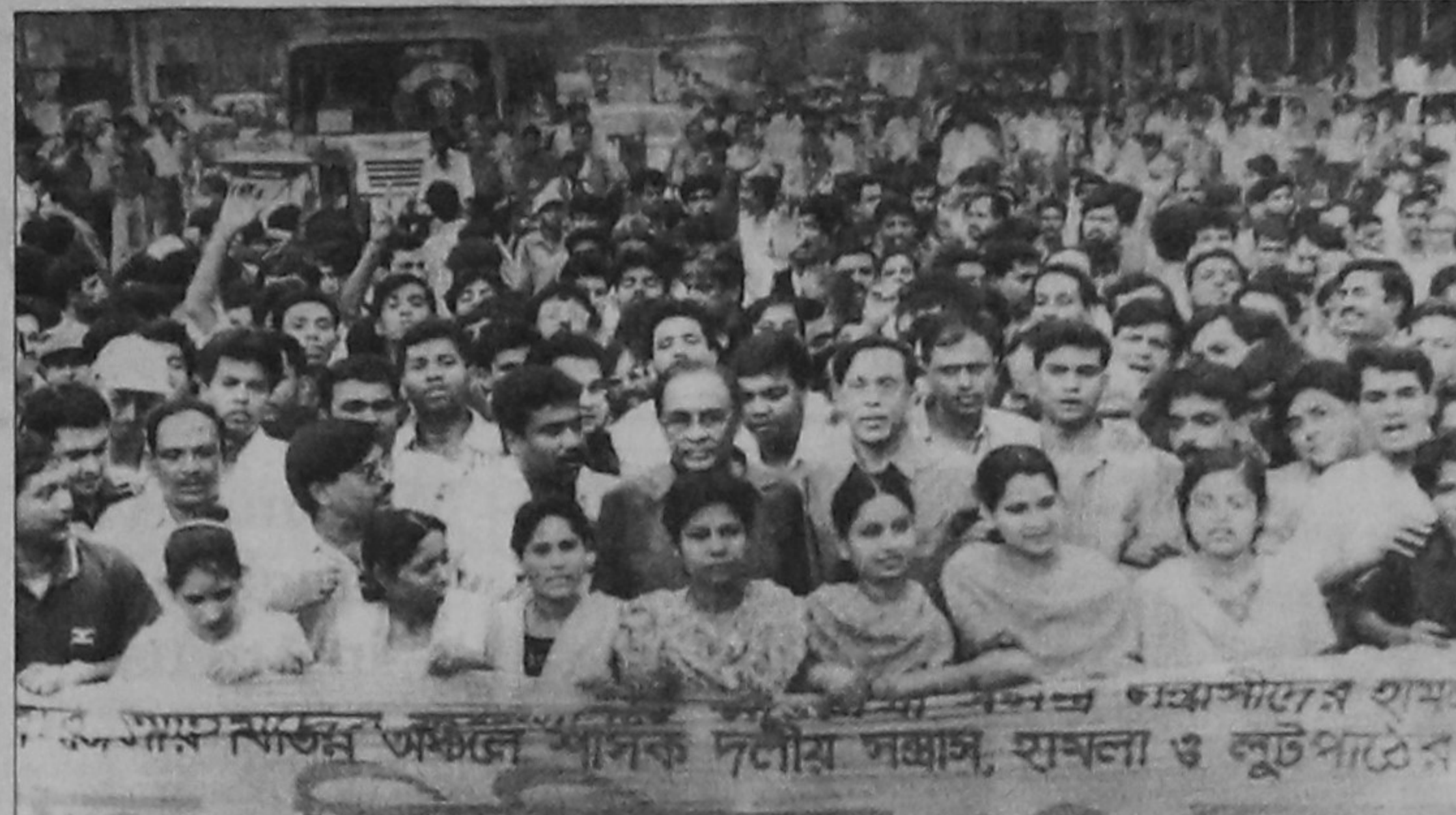
BNP activists brought out a procession in the city yesterday protesting the ruling party's 'terrorist activities' across the country.

The second anniversary of death of Justice Zakir Ahmed was observed yesterday with due respect and solemnity.