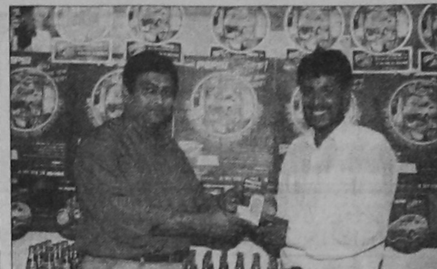
Pepsi has started distributing prizes among the winners of its Scratch and Win promotional campaign. Pepsi officials yesterday distributed radios and electric irons among winners. The company will gradually distribute other prizes among winners. The offer will remain valid until the stock ends.

In another part of Shaanxi, at least eight people were killed on Friday by a rain-triggered landslide in Huxian county, according to the official Xinhua News Agency. It said four people were missing and presumed dead.