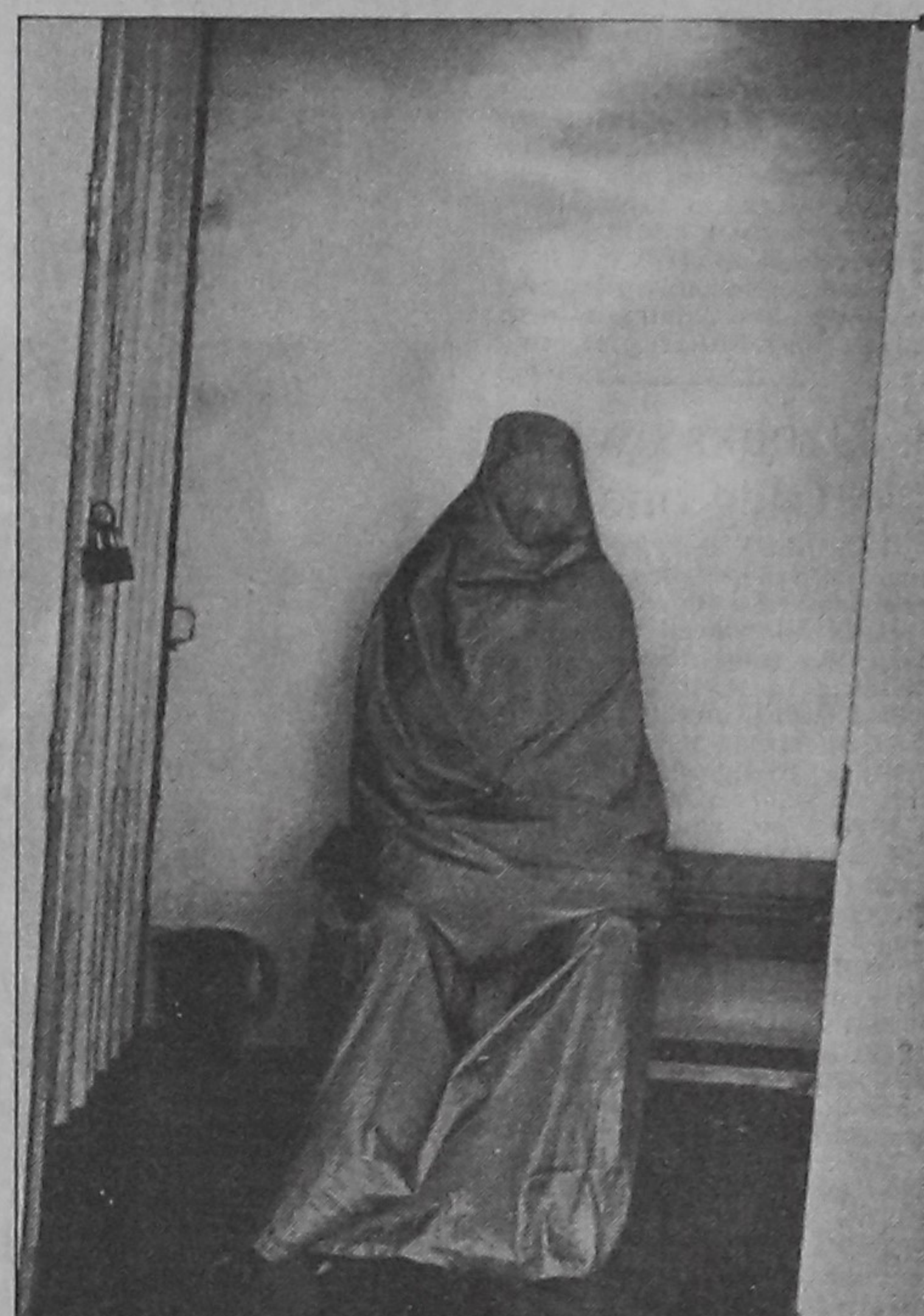
Protected from all eyes

Fragile is a section depicting how women are often left with their