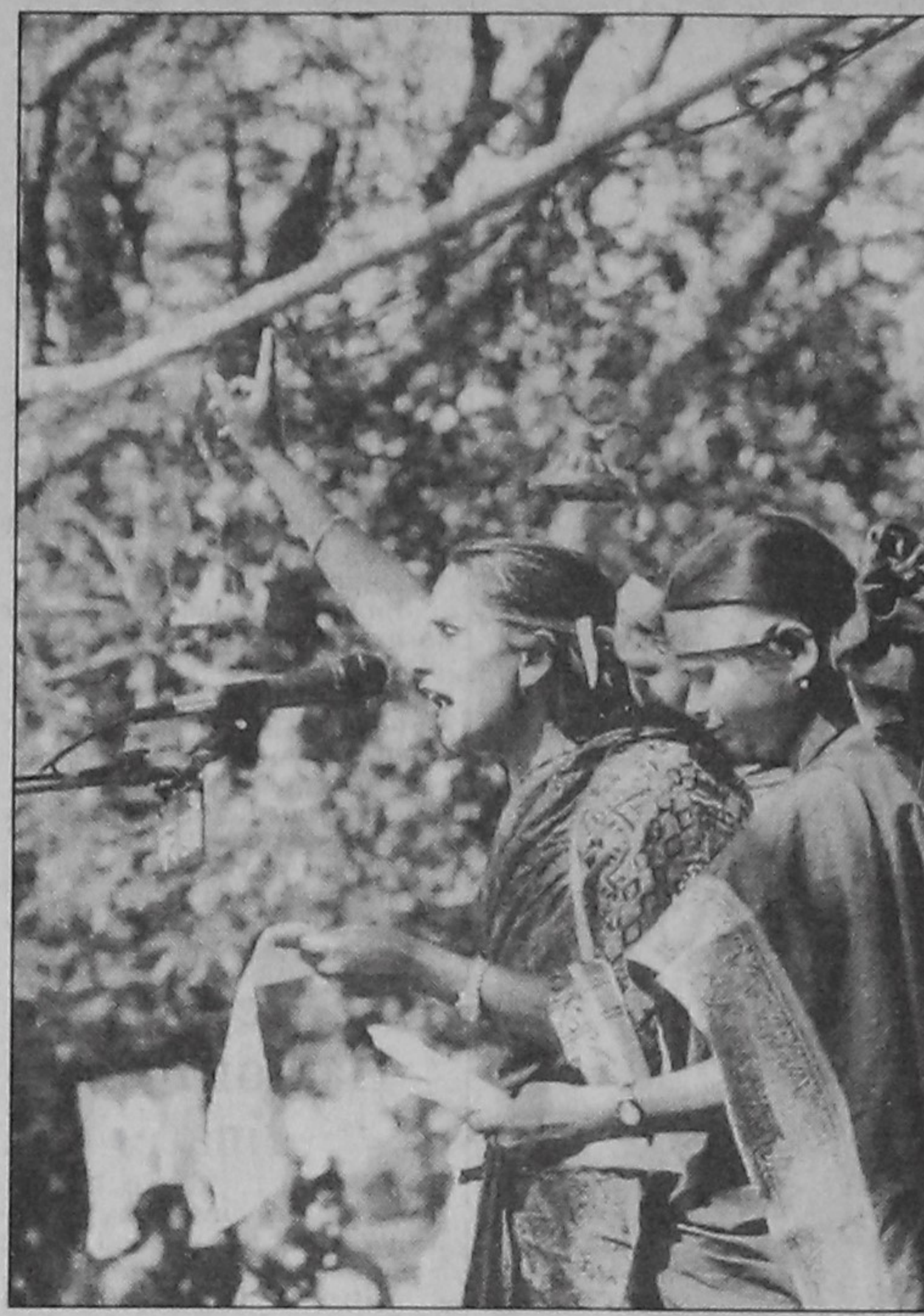
Demanding equal rights

The women and children walking over scorching land with heat waves lashing the hooded faces and the homestead far away