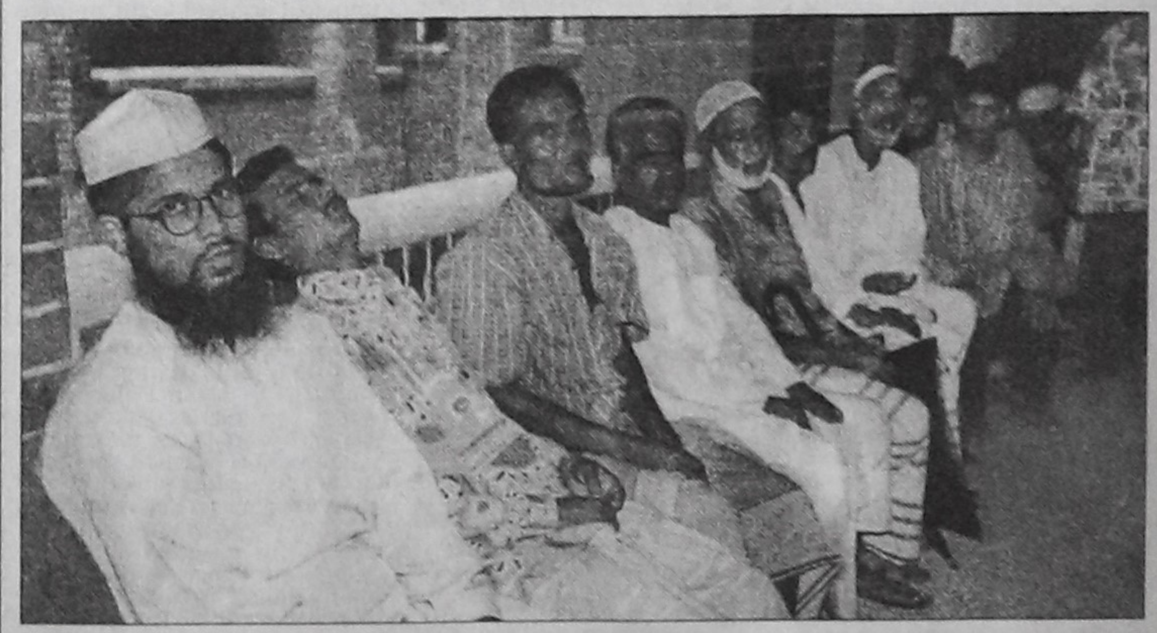
A long queue of outdoor patients at the National Institute of Cardiovascular Diseases (NICVD) Hospital yesterday during token strike observed by the doctors and employees of the hospital.