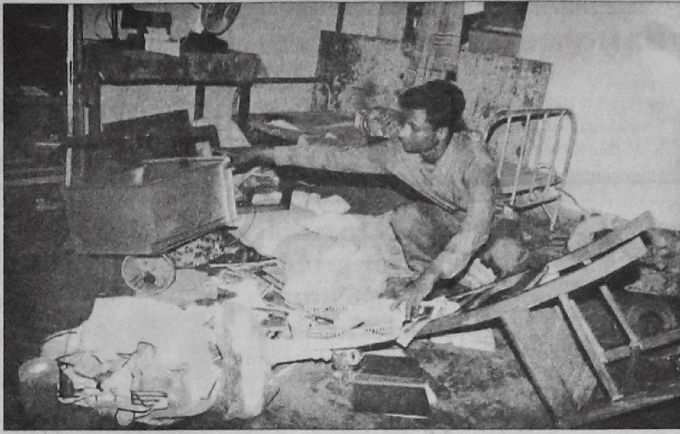
BCL activists ransacked several rooms of Shibir activists at the Fazle Rabbi Hall of Dhaka Medical College on Saturday night.