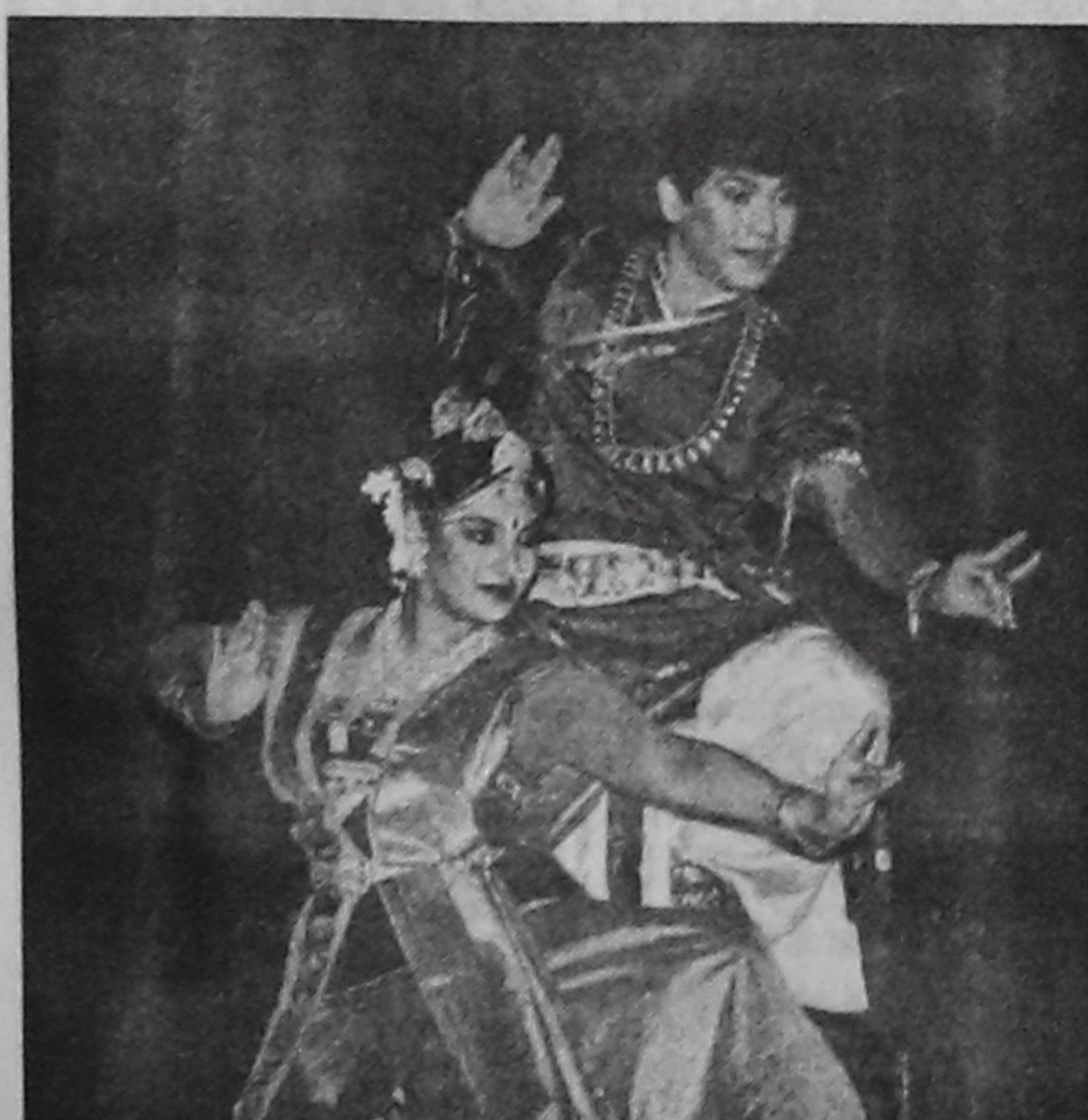
A scene from Bangladeshi Hridaya Hotel (From the Heart of Bangladesh), a dance drama based on the six seasons, presented by Mridanga Sangskritik Sangathan at the Russian Cultural Centre auditorium in the city on Saturday.

Their demands include withdrawal of additional charge for different satellite channels.