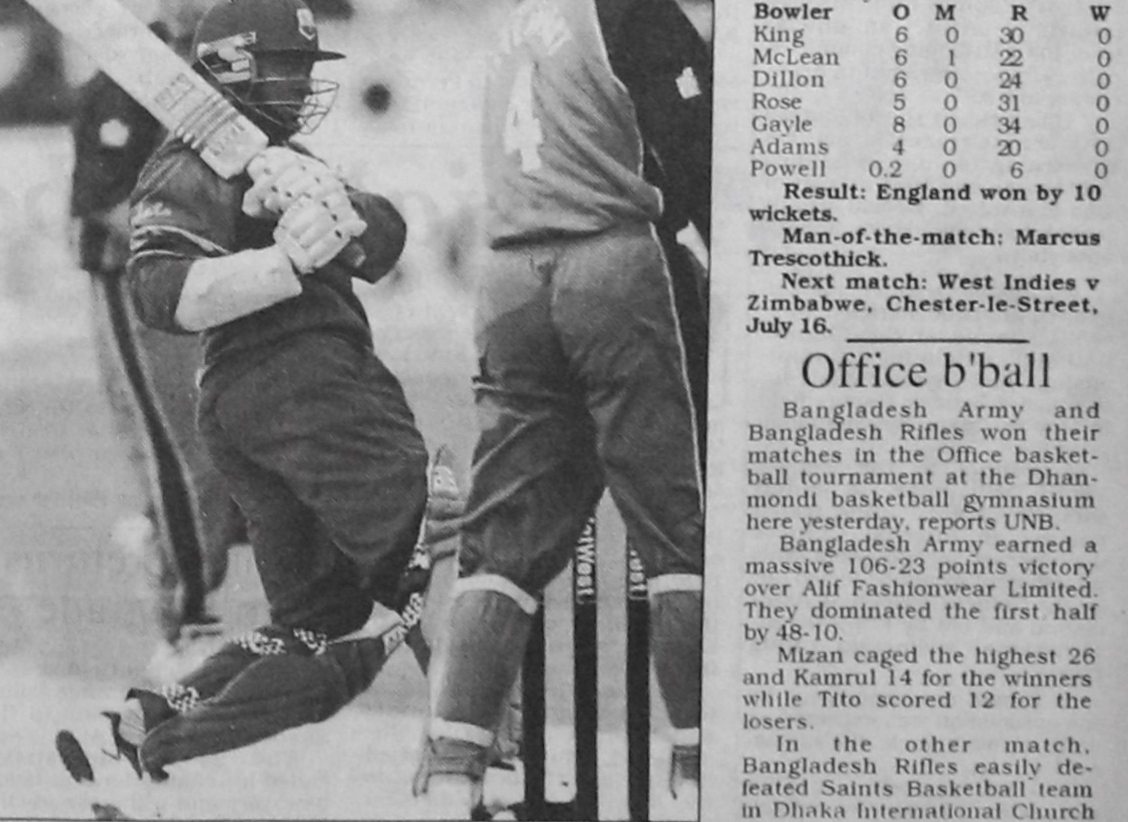
West Indies' Brian Lara follows through on a pull-shot during the NatWest Trophy tri-series one-day international against England at Chester-le-Street yesterday.