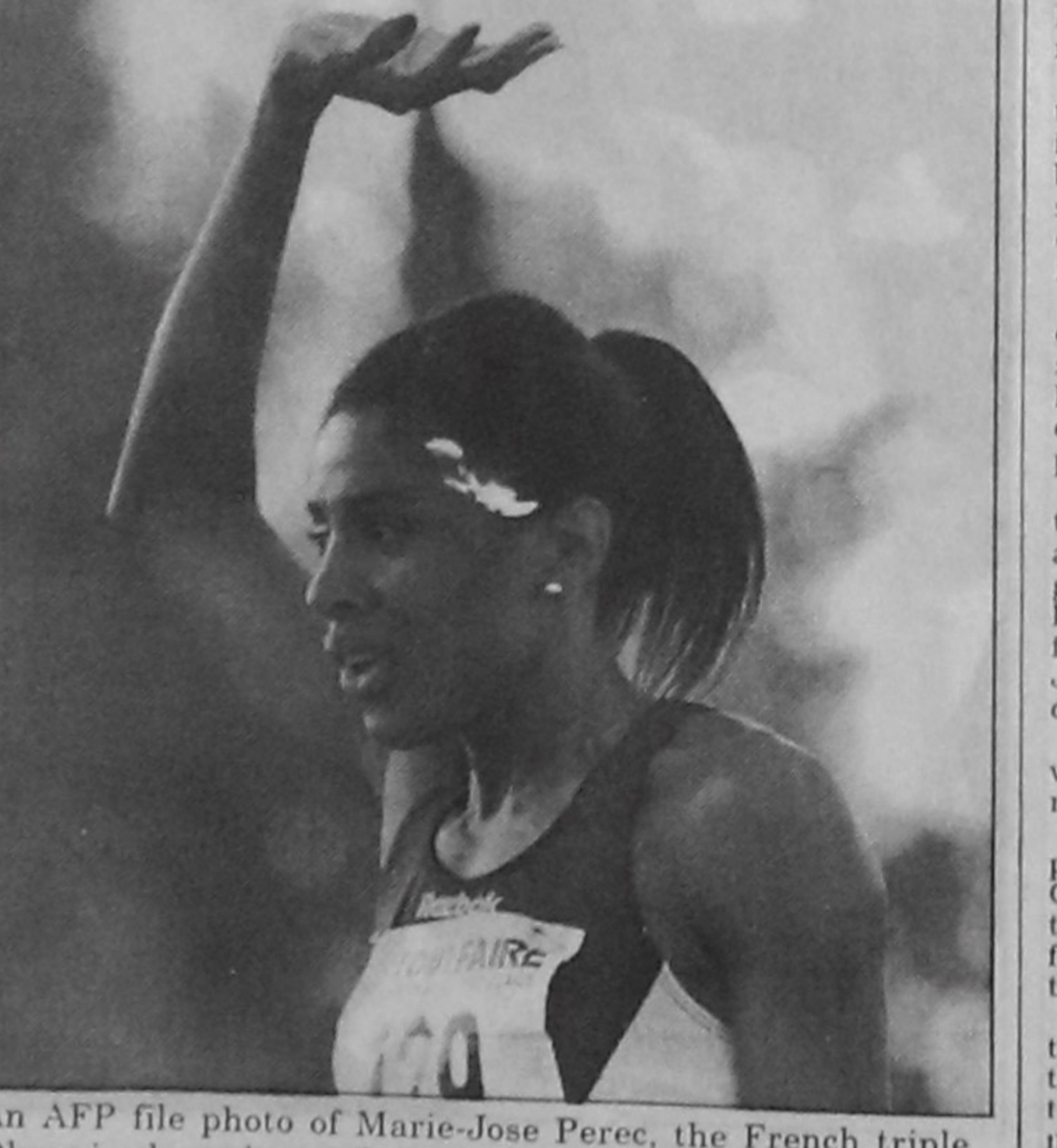
An AFP file photo of Marie-Jose Perec, the French triple Olympic champion pulled out of the European Cup Super League meeting in Gateshead, England yesterday after complaining of thigh pains just half an hour before her scheduled appearance in the 400m.

Northamptonshire are poised to change places with Gloucestershire at the bottom of the division as they go into a fourth day at Cheltenham on the brink of a decisive win.