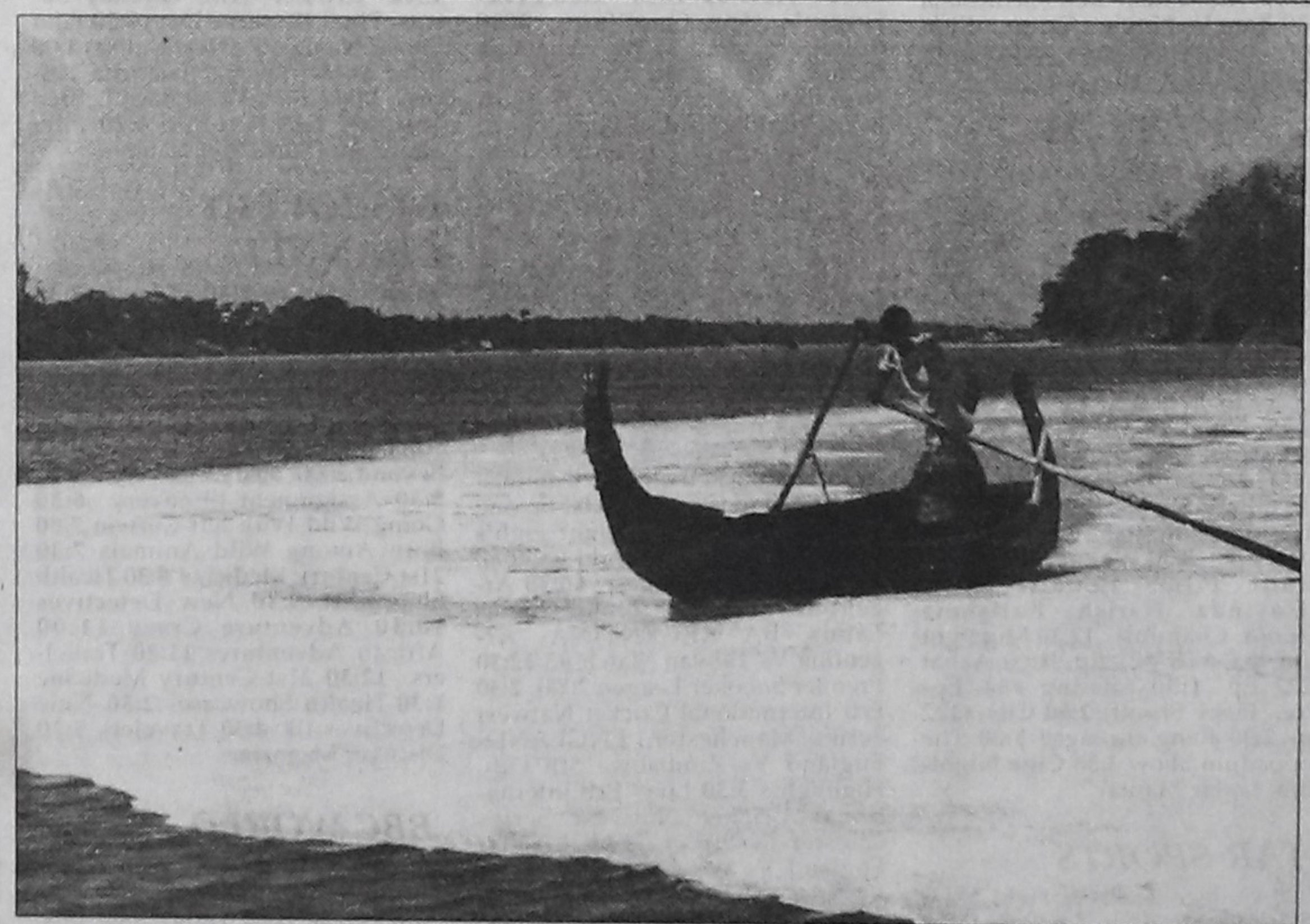
Poor public hygiene: Many varieties of fish species are being destroyed because of dumping of chemical wastes of Karnaphuli Paper Mills in the River Karnaphuli. This practice is legally prohibited but it is widespread. The entire environment of the river is at stake.

There are also allegations that the Emergency Medical Officers (EMO) seldom touch the patients except in special cases. Brothers (male nurses) do everything.