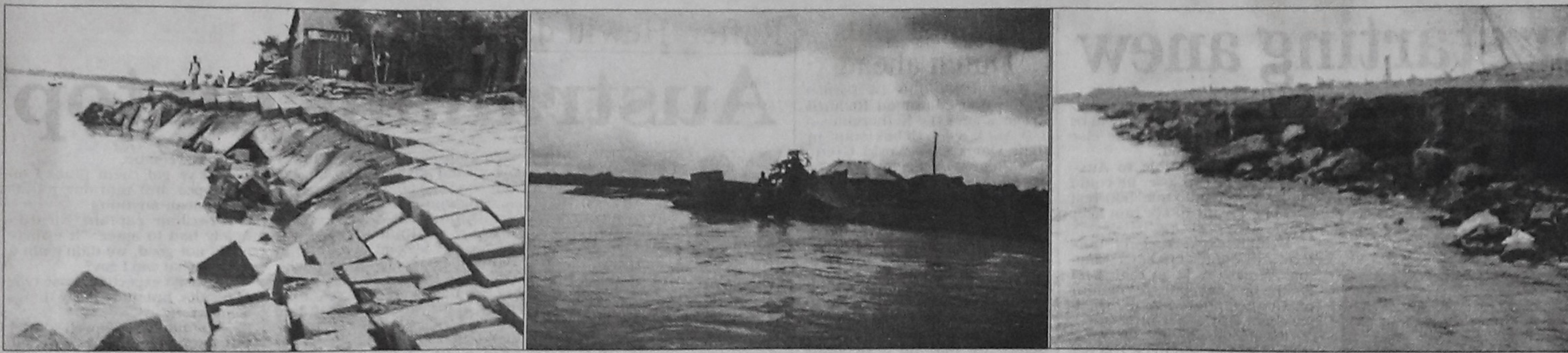
Unabated destruction: (left) The River Meghna's erosion at Jamunaghat of Natun Bazaar in Chandpur (middle) Vast tracts of lands and hundreds of homes have gone under water in four unions of Daulatpur upazila of Kushtia district due to unabated erosion of the Padma (right): Hundreds of families have become homeless in Tangail district because of erosion by the Jamuna.