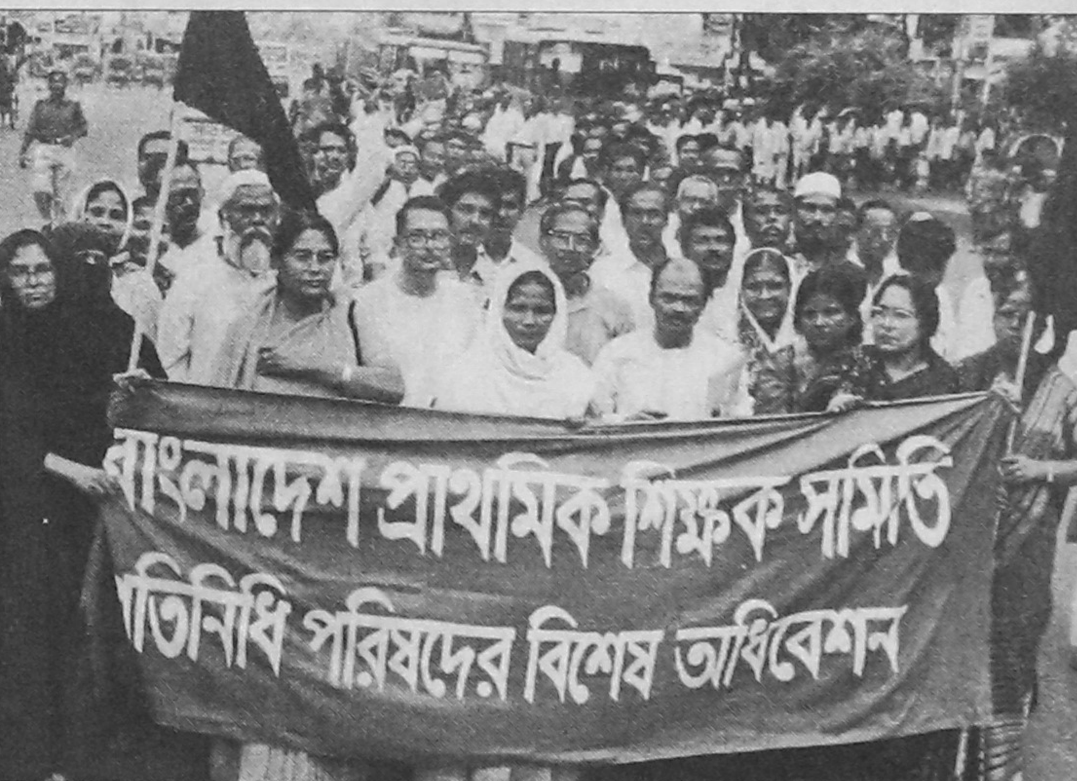
Bangladesh Primary Teachers Association brought out a procession in the city yesterday in support of their various demands including 100 per cent dearness allowance.

Meanwhile, supporters of BCL staged demonstrations at different places in the city demanding immediate arrest of the killers of eight people.