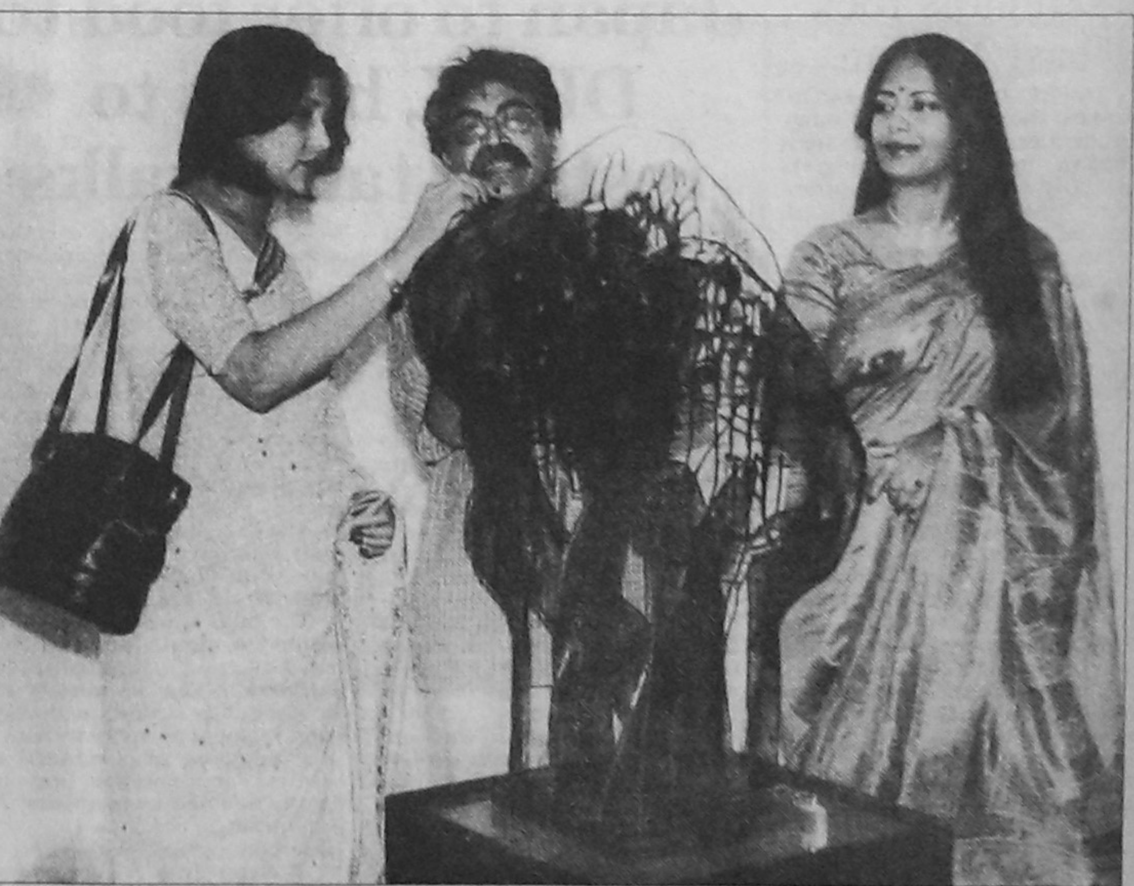
Visitors admire an exotic creation by artist Kazi Rokib at his exhibition on Porcelain and Glass pieces ongoing at Alliance Francaise de Dhaka in the city.