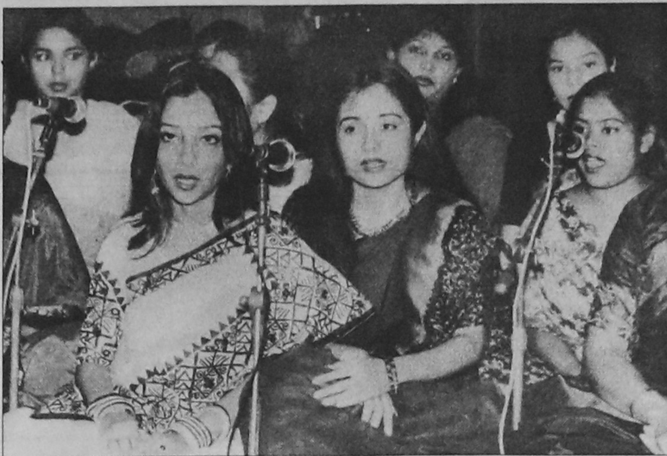
Students of Surtuli Sangeet Bidyaniketon present a chorus number at a cultural evening they held at the Russian Cultural Centre auditorium in the city yesterday.