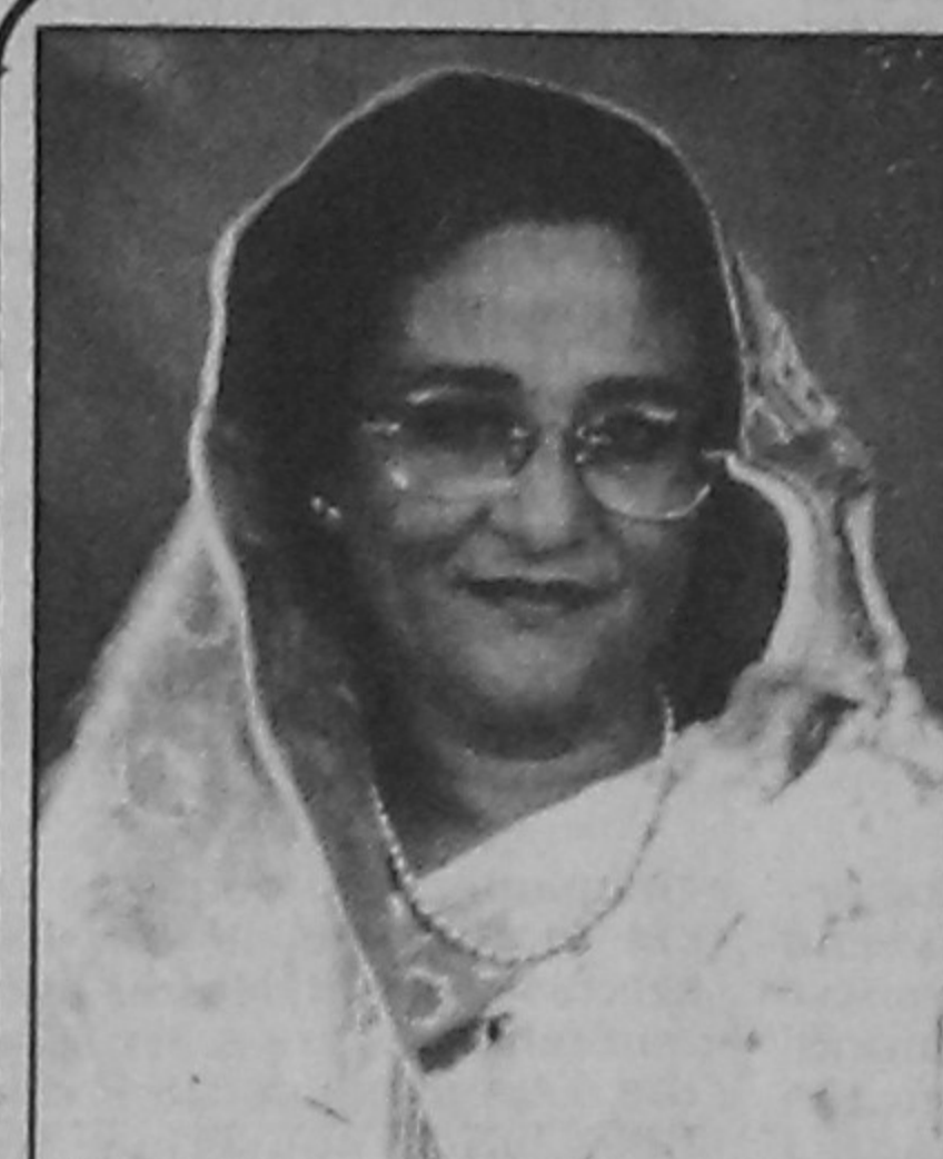
Prime Minister Government of the People's Republic of Bangladesh 31 Ashar 1407 15 July 2000

অঙ্গসজ্জা ও পরিকল্পনায় ৪ দিনিউ এ্যাড মিউজিয়াম