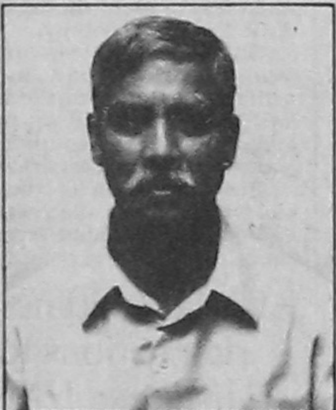
Executive Chairman Bangladesh Export Processing Zones Authority