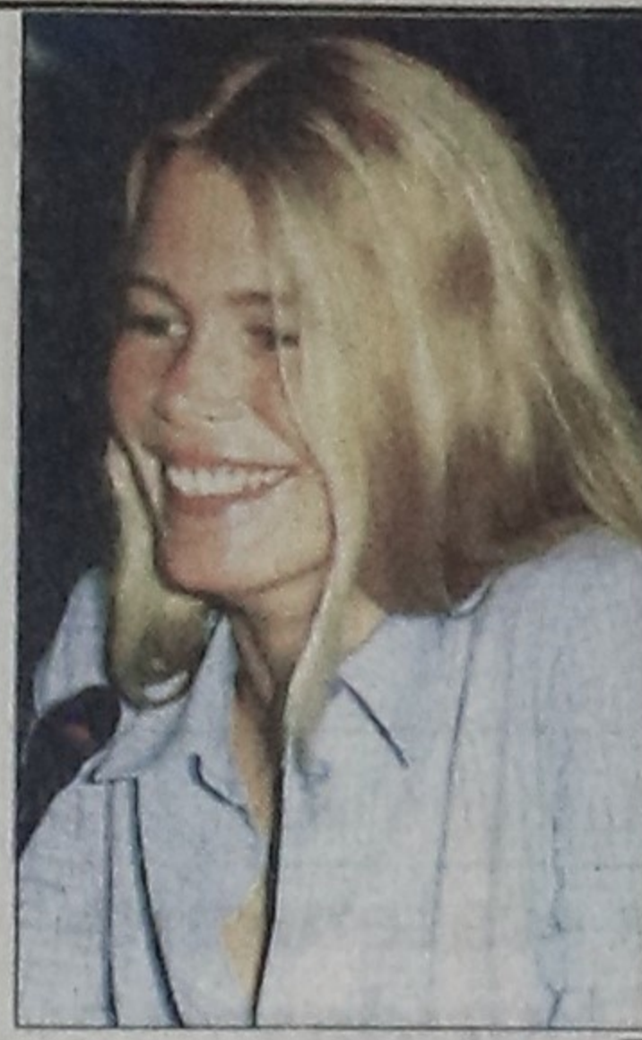
Claudia Schiffer On a mission to eradicate polio

Jatiya Party, Jamaat-e-Islami and Islami Oikya Jote also held separate rallies at Kalabagan, north gate of Baitul Mukarram mosque and Purana Paltan areas respectively.