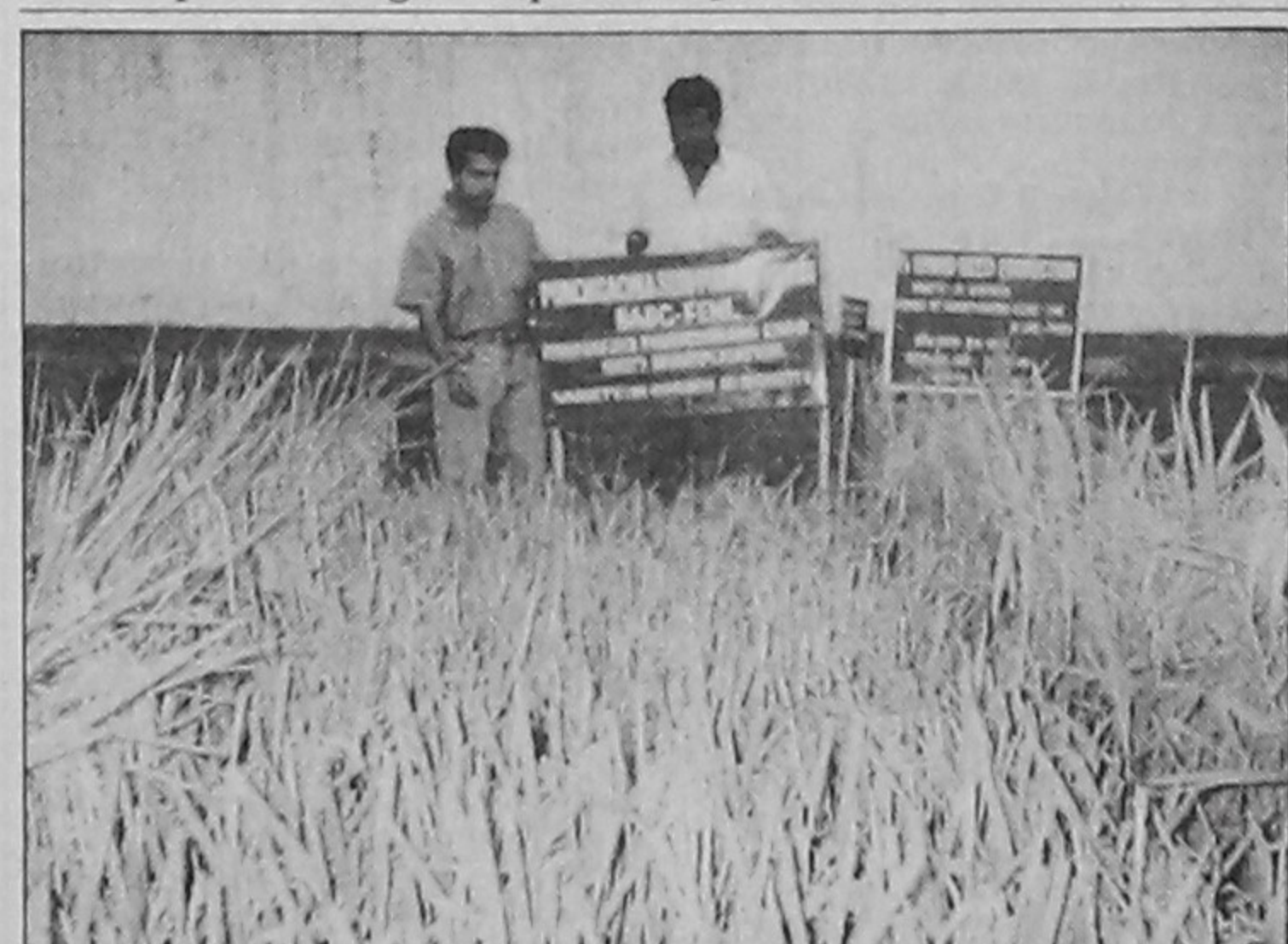
A demonstration plot of BADC Pangachia Farm in Feni where two new types of high yielding variety (HYV) of paddy have been invented recently.