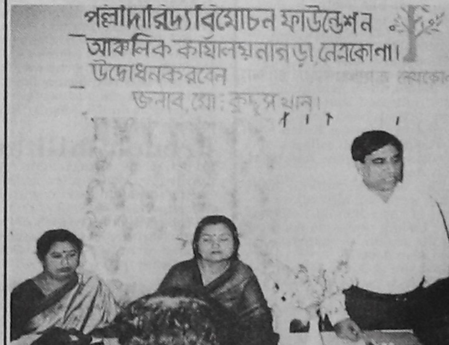
Deputy Commissioner (DC) of Netrakona inaugurating the district office of Palli Daridra Bimochon Foundation, an organisation of poverty alleviation, recently at Nagra in Netrakona town.