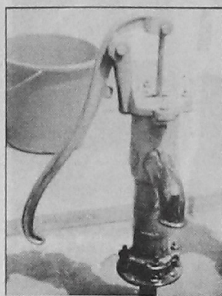
Water of this tubewell at Kalmakanda village in Netrakona district contains arsenic beyond permissible level. Villagers have been advised not to use the water of the tubewell.

Arsenic mitigation programme through re-sinking of tubewells