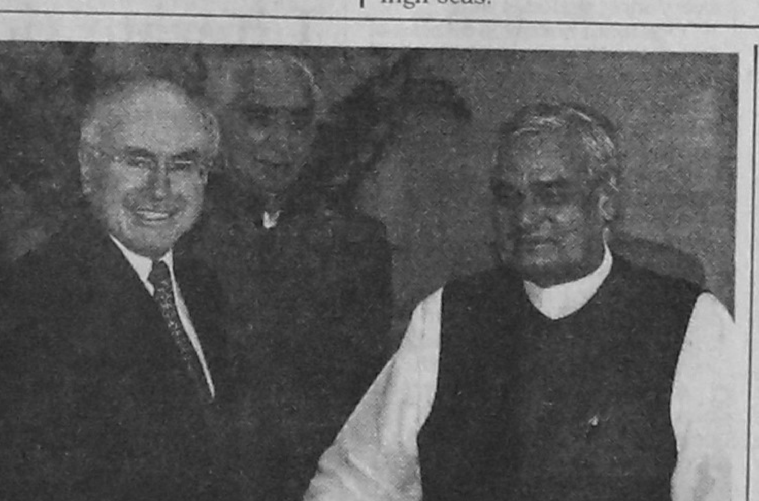
Australian Prime Minister John Howard (L) greets Indian Prime Minister Atal Behari Vajpayee (R) as Indian Foreign Minister Jaswant Singh (C) looks on, prior to talks on Monday. Howard is on a two-day official visit to India.

Hundreds of houses burned in Java JAKARTA, July 11: Thousands of people were homeless and one person dead after fighting broke out on Indonesia's main island of Java, police said today, reports AP.