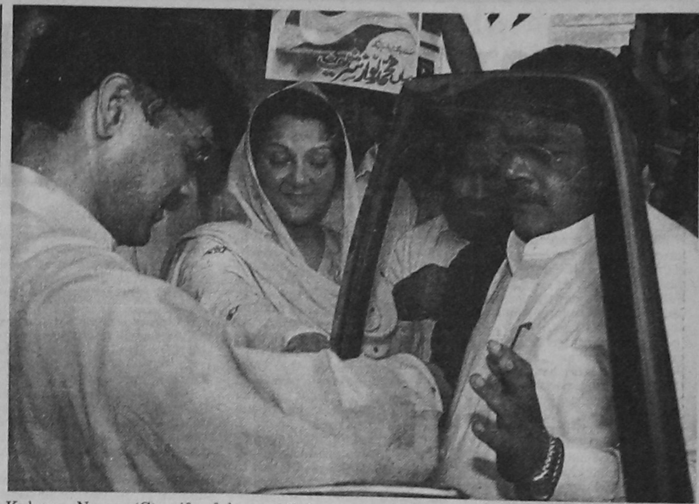
Kulsoom Nawaz (C), wife of deposed Pakistani prime minister Nawaz Sharif stands among her party members in Lahore on Monday. Kulsoom said the authorities had put her under house arrest and police besieging her home were not allowing members of her family to enter.