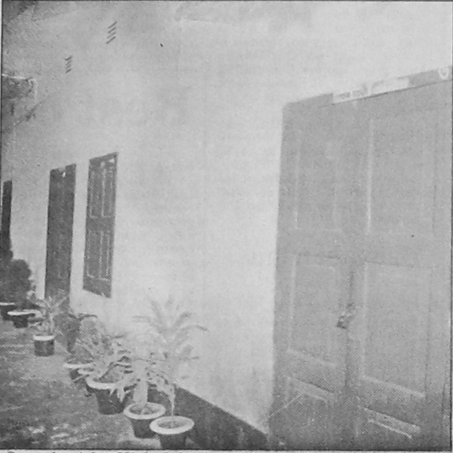
Segunbagicha High School on the first day yesterday of the indefinite strike by non-govt school teachers.