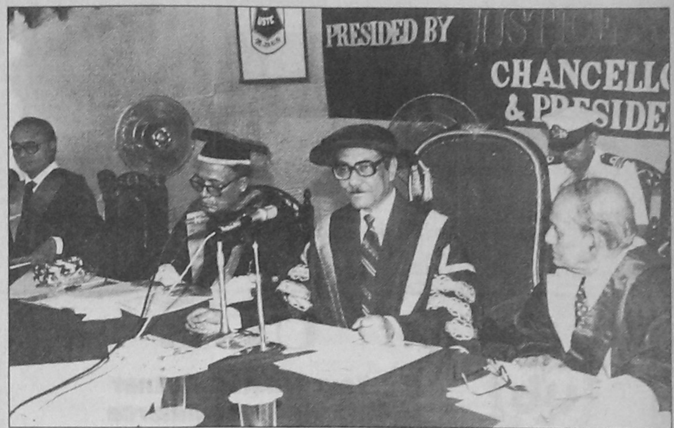
President Shahabuddin Ahmed addressing the first convocation of the University of Science and Technology in Chittagong yesterday.