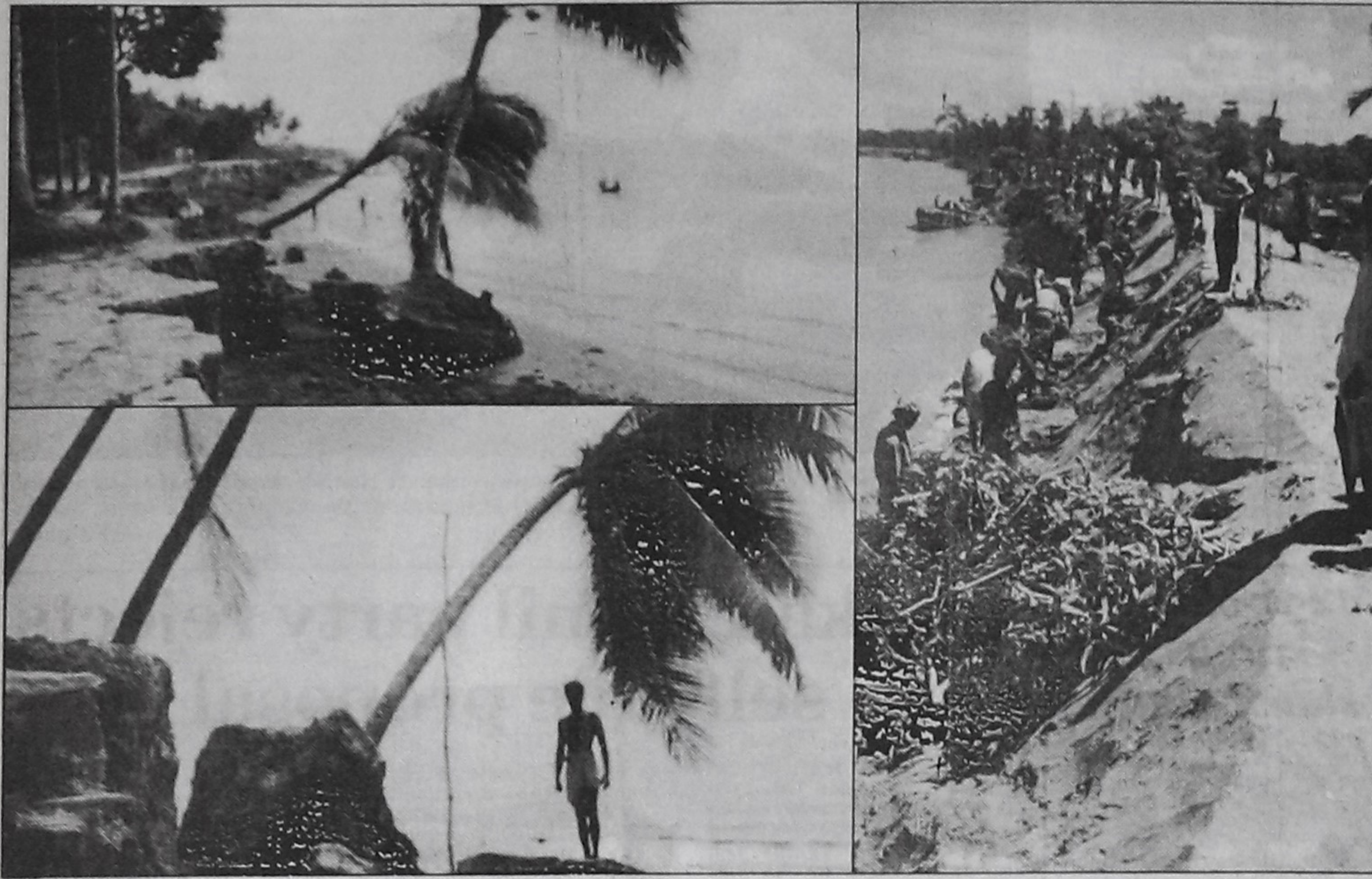
Erosion by the River Meghna in Chandpur is devouring vast tracts of land. Photo on top left is from Soladia in Haimchar upazila. Photo on bottom left is from Taskerhand area of the same upazila. Photo on right shows officials and staffers of Bangladesh Water Development Board (BWDB) frantically trying to save Chandpur Irrigation Project (CIP) by dumping blocks.