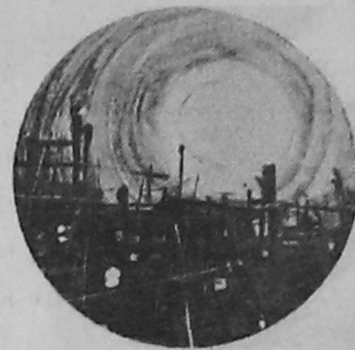
Moonlit Night 17" X 17", Acrylic on Board by Mahmudur Rahman Dipon