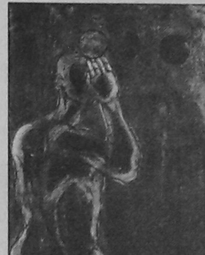
Geometry of Mind, Mixed Media by Mustafa Zaman

Salahuddin's Threatening Sky , Image of the City and City of Tempo are three realistic works. These dealt with a very common portentous concern — environmental deterioration,