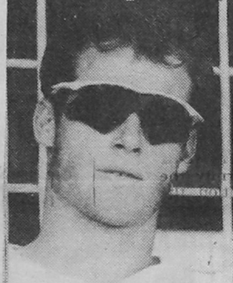
JOHNSON ... m-o-m

They must return to Lord's on Sunday for their second match of the three-nation tour.