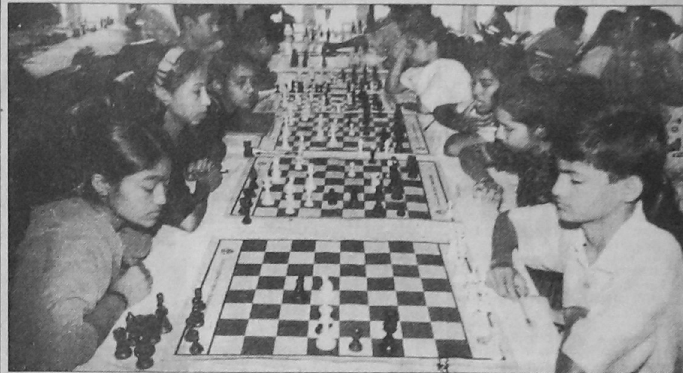
Scene from the sixth round of the second Standard Chartered Bank Schools' Chess Tournament at the NSC yesterday.

Houvion insisted that the crowd should not expect a great performance from the 1996 Olympic gold medalist.