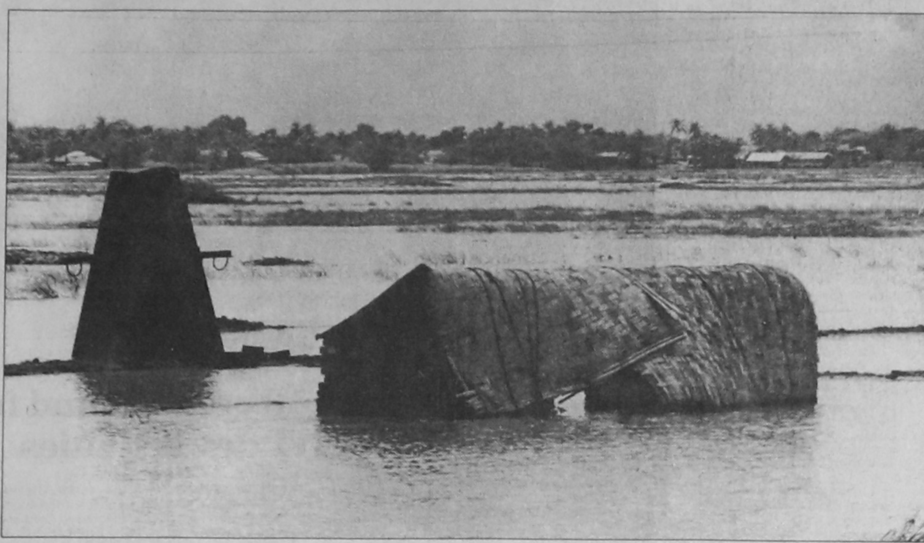
All at standstill: Rising water levels in low-lying areas around the city have halted work at many places. Seen in the picture is a brick kiln at Gabtoli lying under water.