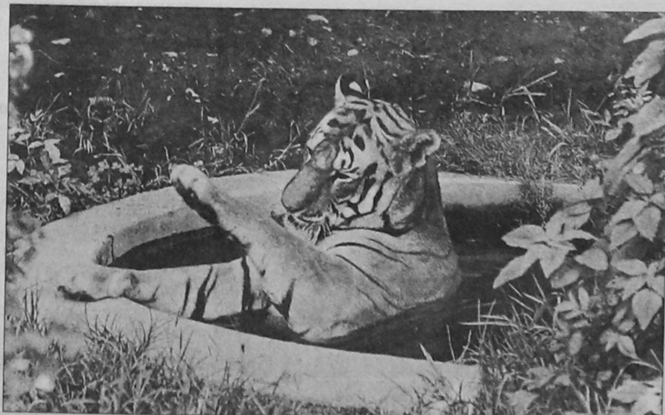
A tiger cools off in a pond at the central zoo at Jawalakhel in Kathmandu yesterday. Temperatures around the Nepalese capital were as high as 28 degrees centigrade on the hot sunny day.