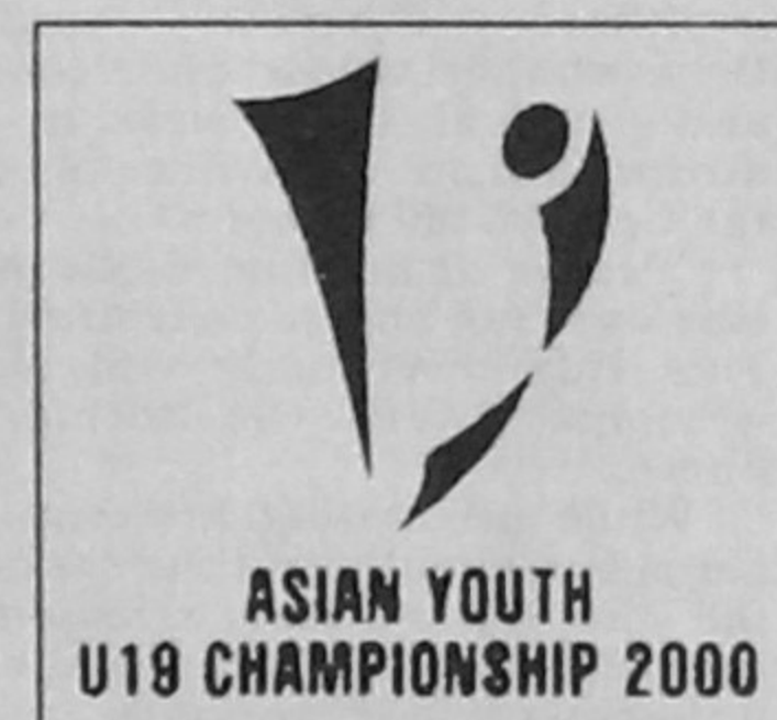
ASIAN YOUTH U19 CHAMPIONSHIP 2000