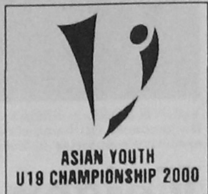
ASIAN YOUTH U19 CHAMPIONSHIP 2000

Bangladesh trained at the local Police Lines ground while Maldives players warmed-up at the main venue of the qualify-