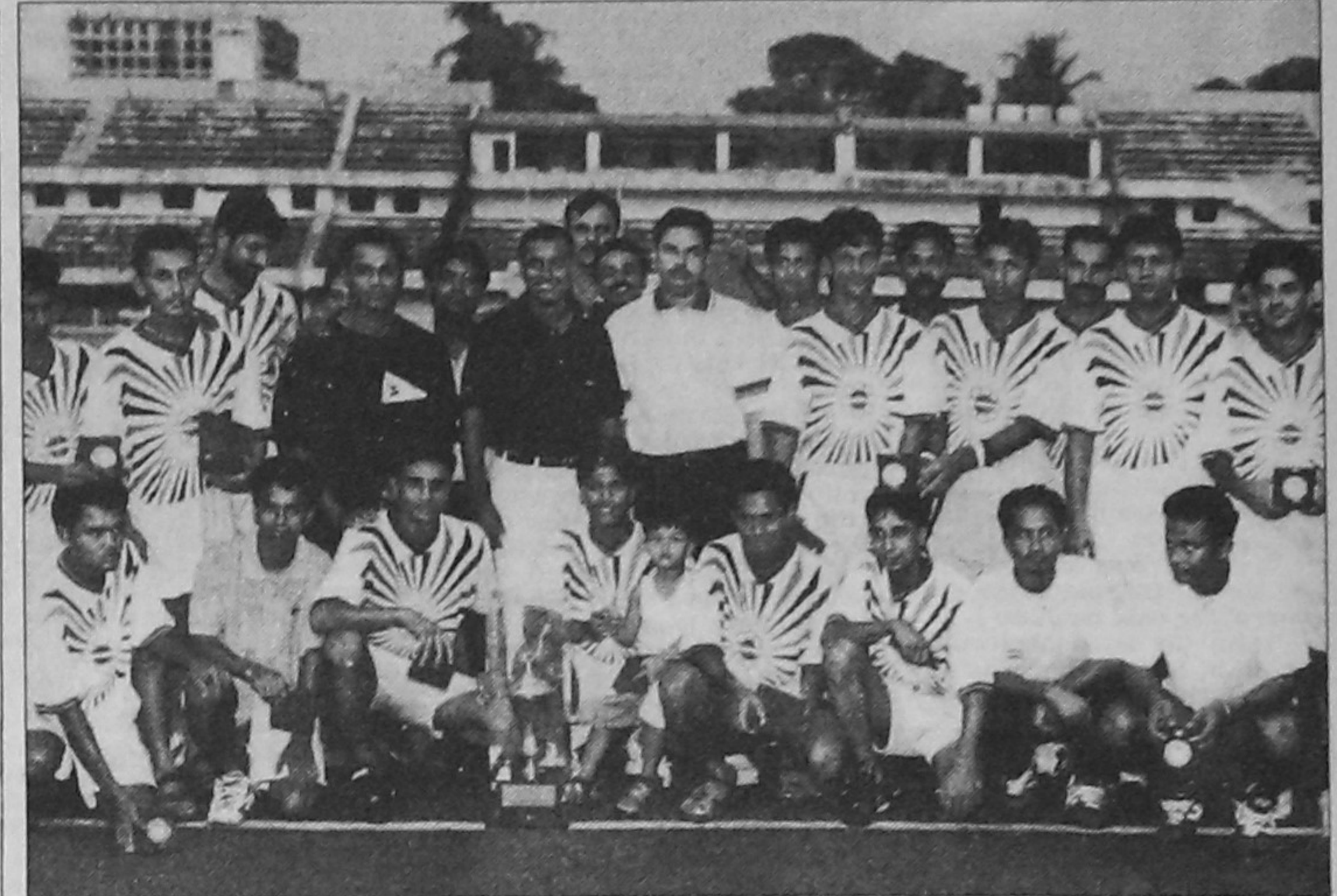
Players and officials of the victorious Usha Krira Chakra, who retained the Ragib Ali Gold Club Cup, pose with the trophy after their win over Abahani in the final at the Maulana Bhasani National Hockey Stadium yesterday.

United pulled out of the FA Cup to compete in FIFA's inaugural Club World Championship in Brazil after the British government and the Football Association made it clear that England's chances would be harmed by their non-participation.