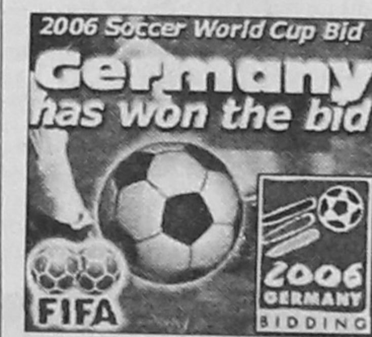
JOHANNESBURG, July 6 (Reuters/AFP): South Africa sighed with grief and hit out at European soccer powers today after losing out to rival Germany in its bid to host the 2006 World Cup.

Parties planned across the country were cancelled or fizzled out, leaving most South Africans to think of what might have been - the biggest sporting event ever to grace Africa.