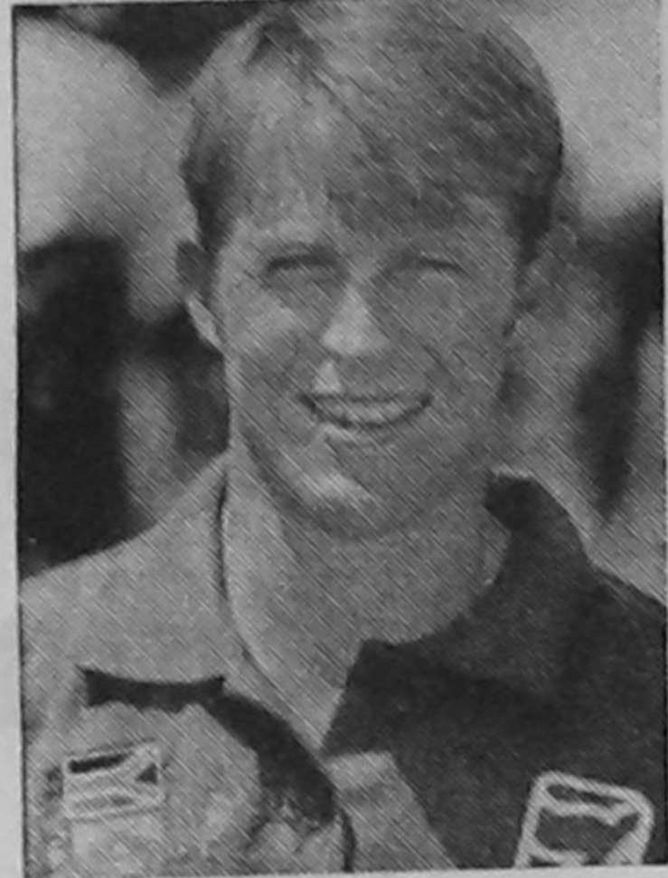
Jonty Rhodes (South African cricketer) "People regarded me as more of a one-day player, but I am a better Test batsman these days."