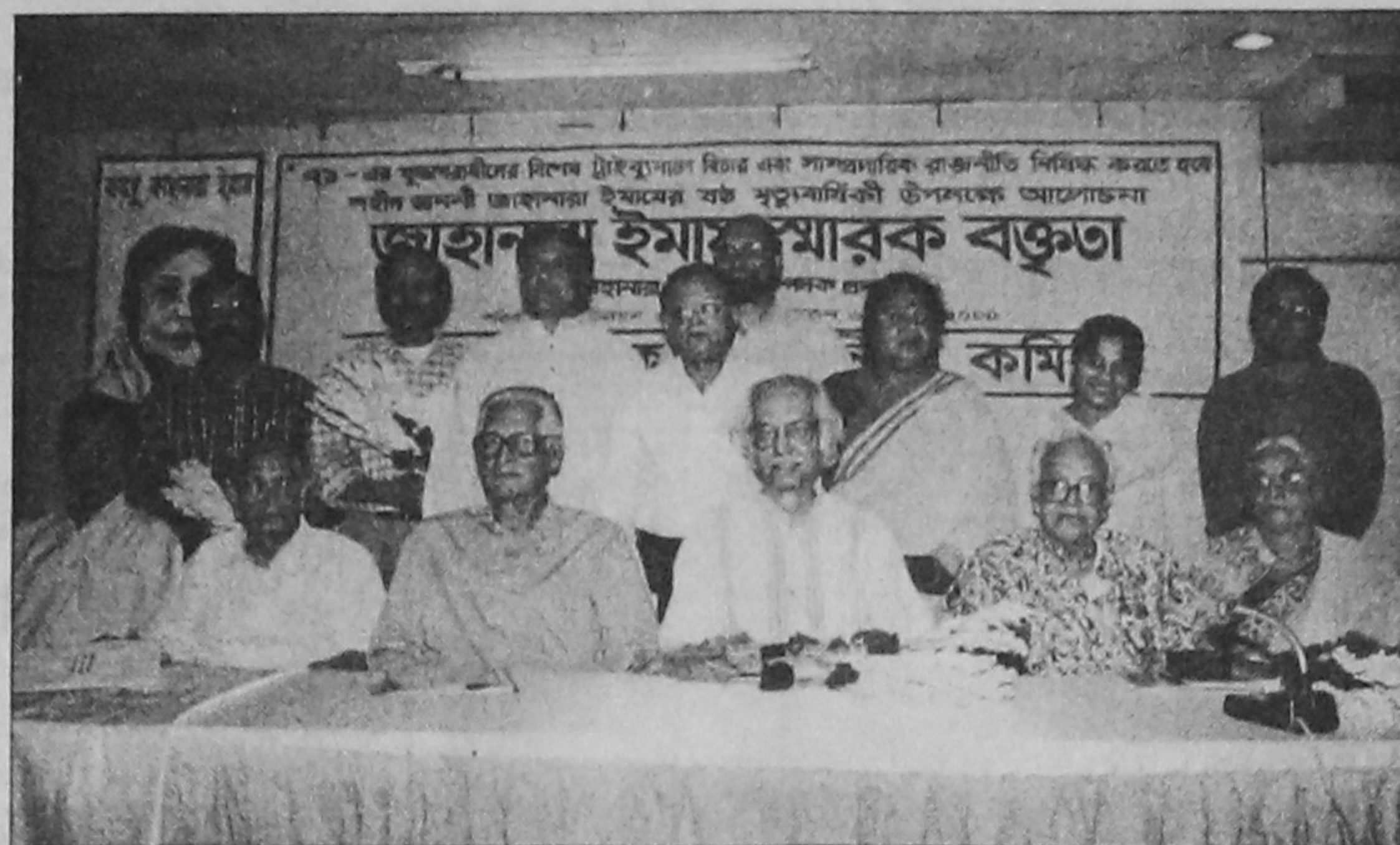
Recipients of the Jahanara Imam Memorial Medal seen together at the Academy of Development Planning at Nilkhet yesterday.