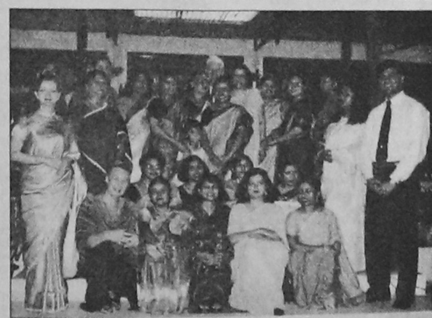
The first batch of teachers from Aga Khan School who completed a training programme under the Institute of Education Development (IED) of Aga Khan University received certificates yesterday on completion of the course.