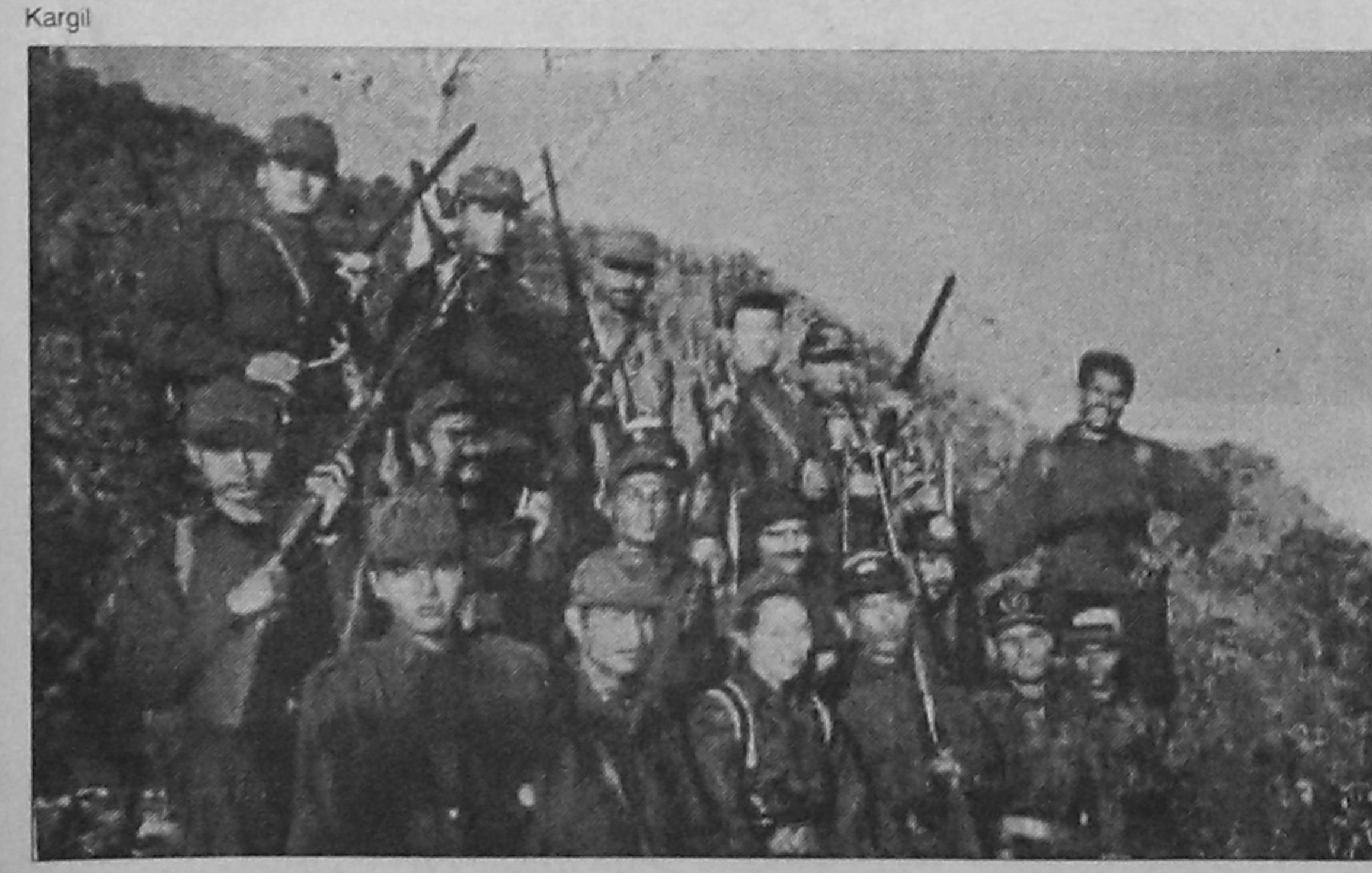
Maoinsts in Nepal

With Pakistan being taken over by the military; with Sri Lanka struggling against the LTTE; with India and Pakistan in constant war; with BJP refusing autonomy in Kashmir; with Afghanistan under the Taleban; with Fiji reeling under a coup; with Bangladesh failing to bring in political stability; the South Asian region looks like a mess. What toll all this would take on the state of affairs in this part of the world is still to see. Let's hope the present chaotic situation is not an indication of what lies ahead.