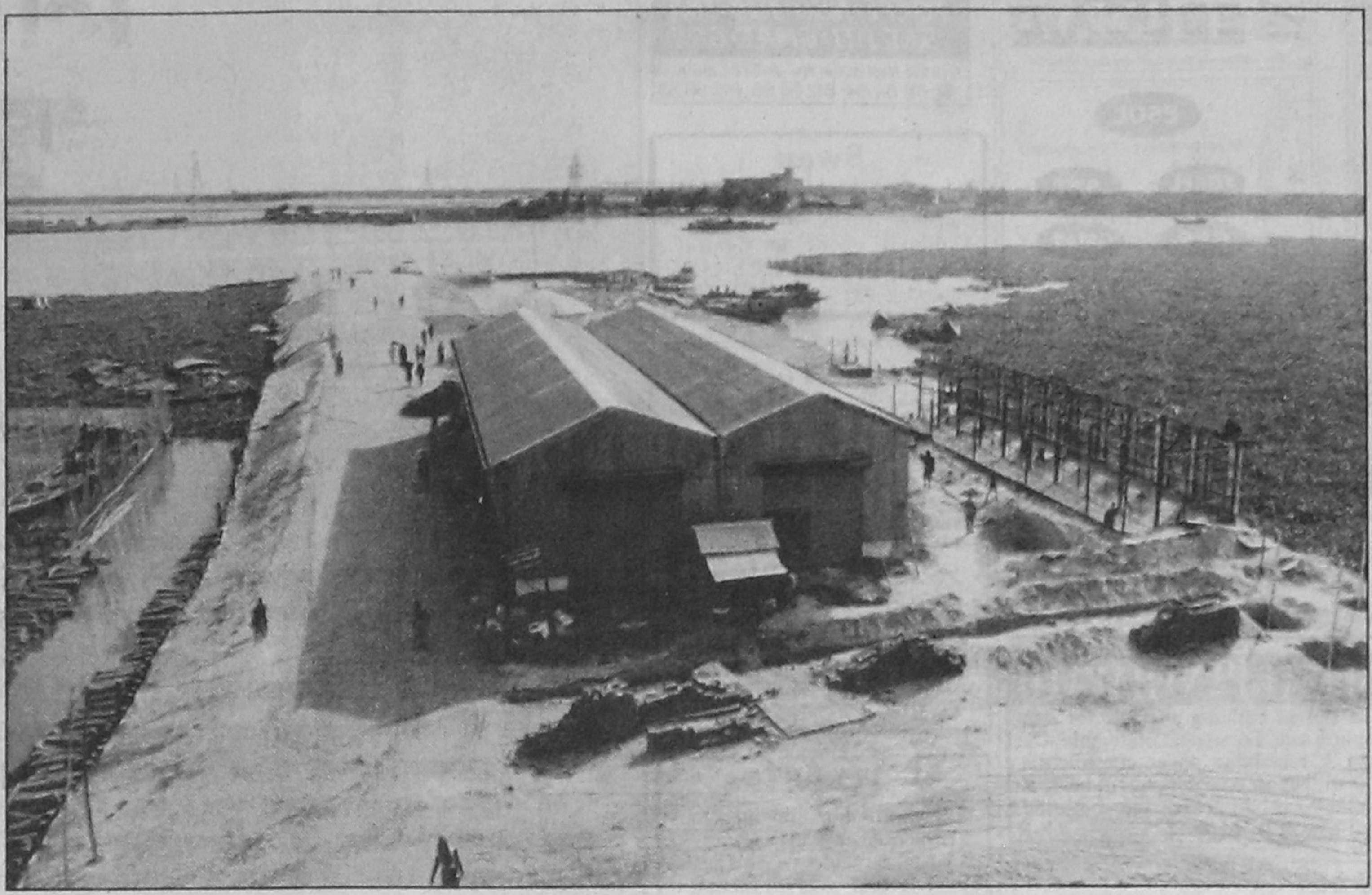
The Sena Kalyan Sangstha (SKS) establishment on the river Buriganga. This is the photograph of the Sangstha's storage facilities, taken on Wednesday showing encroachment of the river. We inadvertently published the photograph of another illegal structure describing it as a SKS establishment. We regret the mistake but will publish the story of that illegal construction very soon.

Kuwait-Iraq Returnees' Association. But the victims said it was a self-styled association formed by some unscrupulous people in connivance with the officials and employees. None of them are its member, the victims said. Asked why they did not lodge complaint with the authorities concerned, they said the office of the Director for UNCC affairs at BMET office was under lock and key for the last few days. This correspondent tried repeatedly to meet The Director General of BMET, but he refused to talk. Sources close to the DG said he took office barely two weeks ago, and is under 'heavy pressure' from a strong lobby of officials who have been realising such toll illegally for years. The DG, a former official of the Bureau of Anti-Corruption, gave a verbal warning to the dishonest officials and employees, but to no effect, the sources said. The Daily Star also reported in late 1998 that Tk. 26 lakh was realised as illegal toll by a