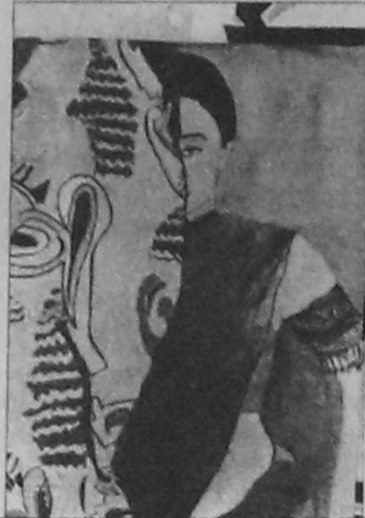
Portrait of an Indian Woman

I've done water-colour, oil on paper, acrylic, crayon, charcoal and pencil sketches. At times my work is of mixed-media quality, and on one occasion