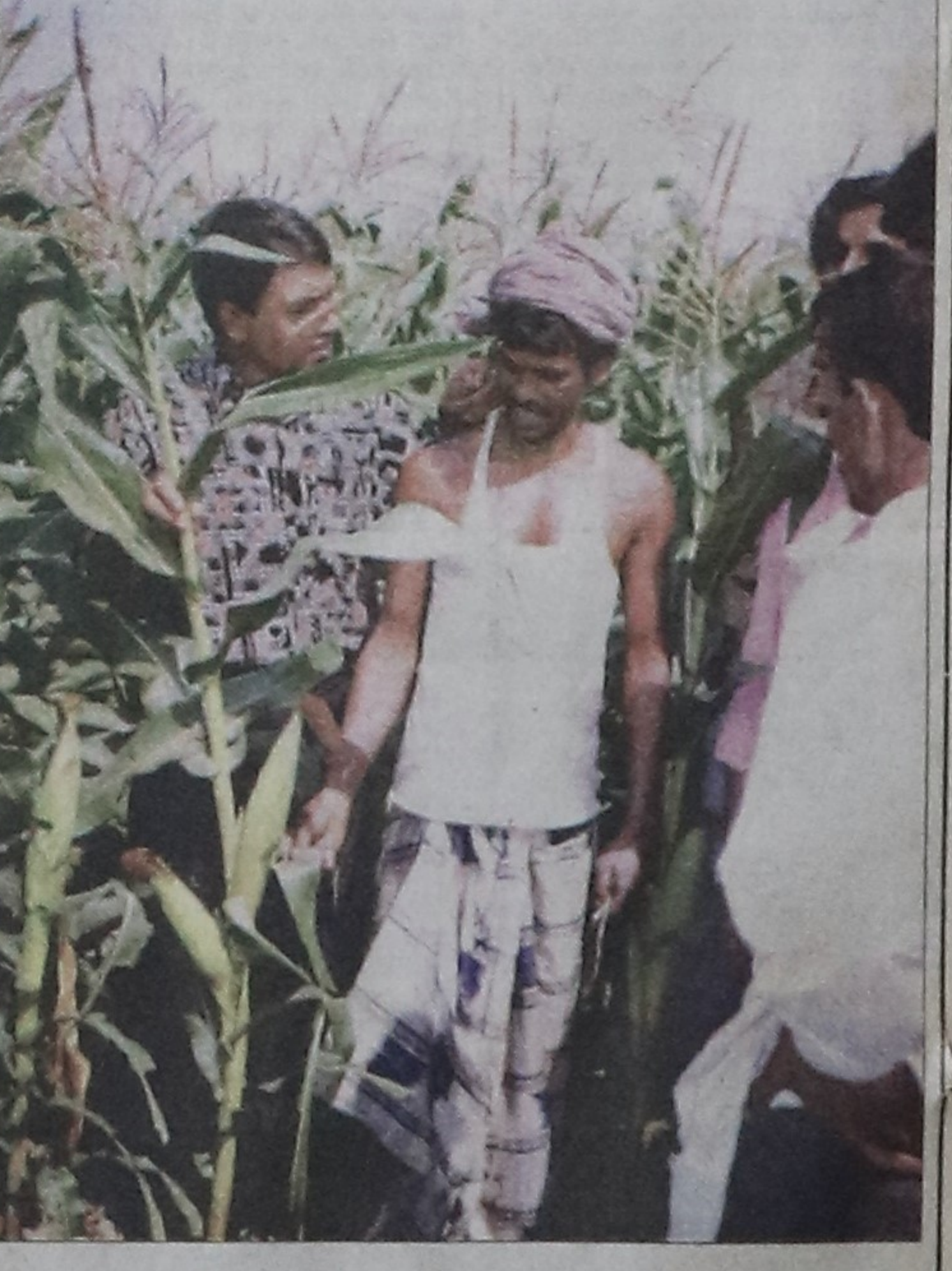
Changing food habit: Maize cultivation has gained popularity in the northern region including Sirajganj district. With the active cooperation from the District Agriculture Extension Department Sirajganj farmers of nine upazilas have grown 100 tons of high yielding variety of maize by bringing 100 acres of land under maize farming in this season. The farmers are now more interested in cultivating the crop in view of profitability and low production cost. This shot has been taken recently from Pipulbaria area under Sirajganj Sadar police station.

Loan distributed PIROJPUR, July 5: Youth Development Department distributed soft-term loan totaling Tk 1.96 crore among youth here in 11 months of the current fiscal, reports UNB. Officials said the loan was disbursed against 2,550 small projects under the government-sponsored Self-employment Project. Upazila-wise breakup of the projects: Sadar-324, Sharupkati-365, Bhandaria-420, Kauhkhali-528, Mathbaria-484 and Nazirpur-429.