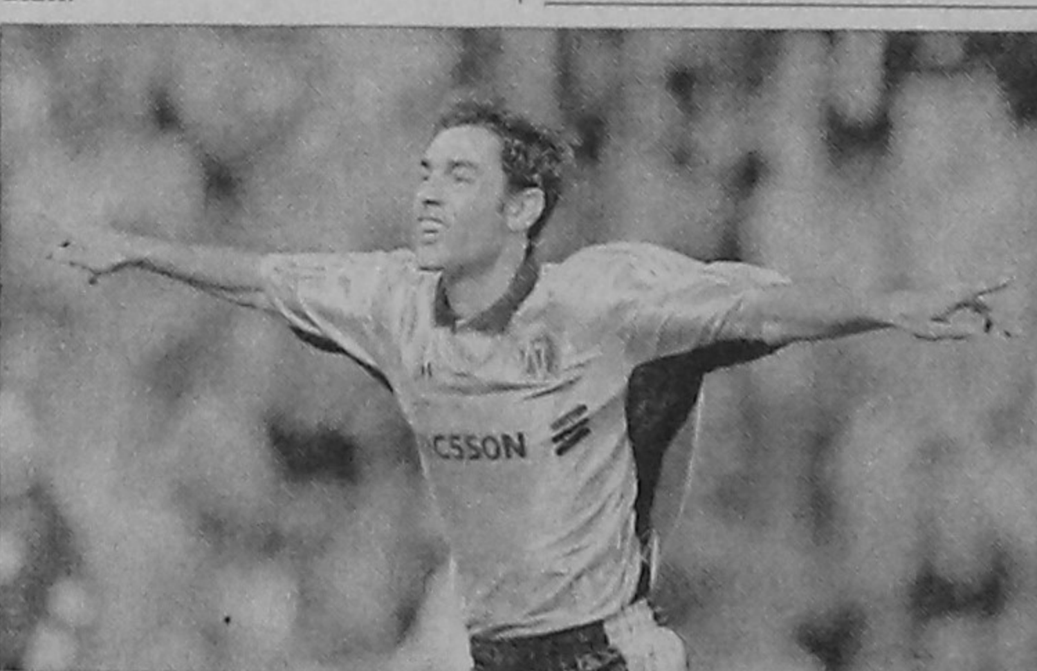
An AFP file photo of French international midfielder Robert Pires who has signed a four-year contract with English Premiership giants Arsenal.

It was Pires who set up the Golden Goal for David Trezeguet in Sunday's 2-1 Euro 2000 Final victory over Italy in Rotterdam.