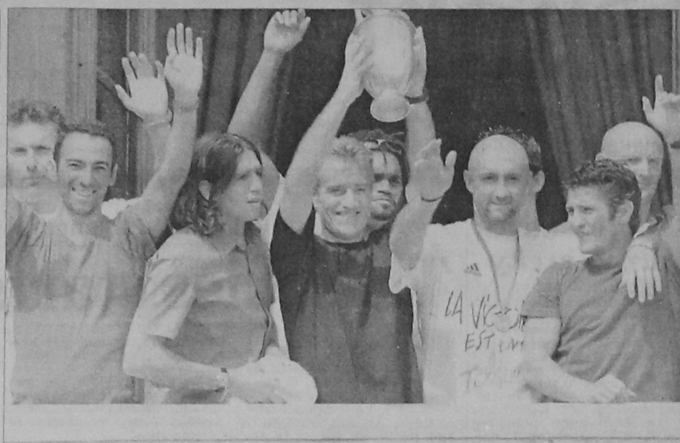
SHOWING OFF THE SILVERWARE: French skipper Didier Deschamps (C) holds aloft the European Cup while his teammates acknowledge the applause from fans at the Place de la Concorde in Paris on July 3.

"It will lead to the uplifting of not only of our people but will also contribute to the growth of our economy," Mandela added.