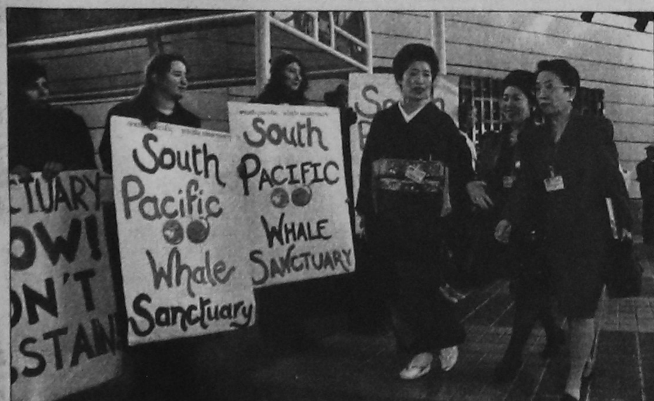
Japanese observers walk past pro-sanctuary protesters before the vote on the proposed South Pacific Whale Sanctuary at the IWC meeting in Adelaide yesterday. The whale sanctuary proposed by Australia and New Zealand failed to gain the required three-quarters majority of the commission after heavy lobbying of the Caribbean states by Japan and Norway.