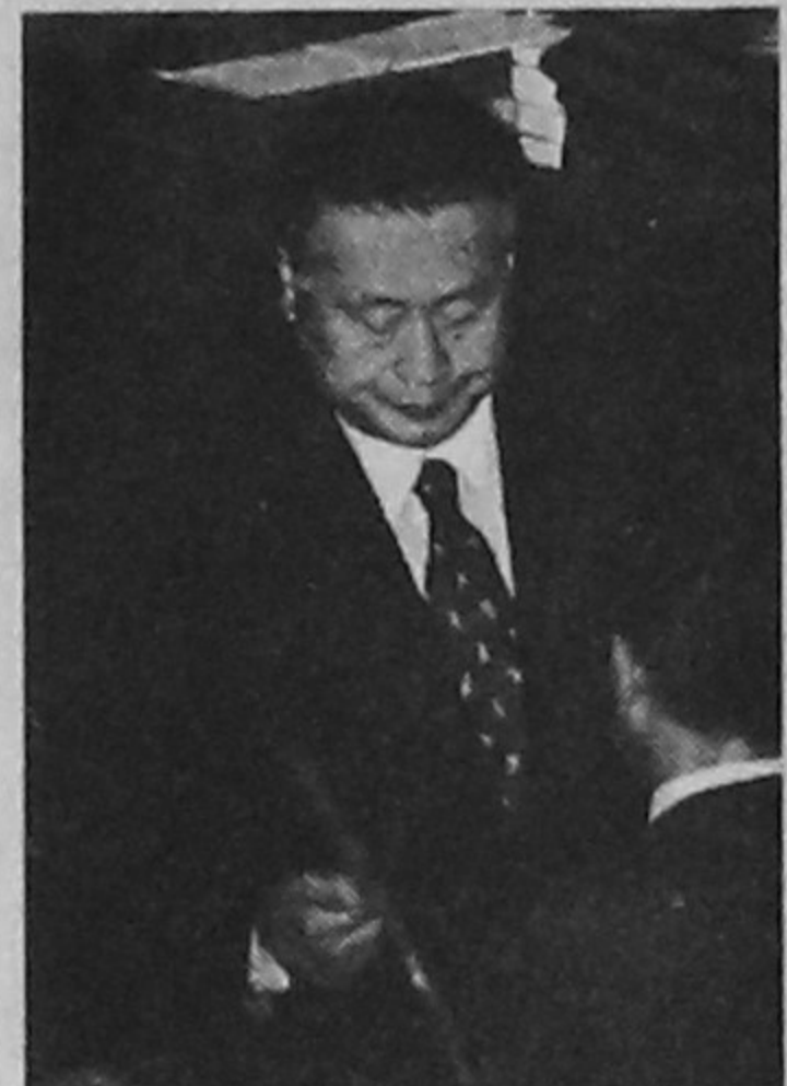
Japanese Prime Minister Yoshiro Mori casts his ballot during an election for next prime minister in the lower house of parliament yesterday. Mori was re-appointed by 284 votes in the 480-seat chamber.

The US press reports said that in a recent classified briefing at the US Congress, lawmakers were presented with evidence that China has continued to ship guidance and other systems to Pakistan, also offering technical expertise.