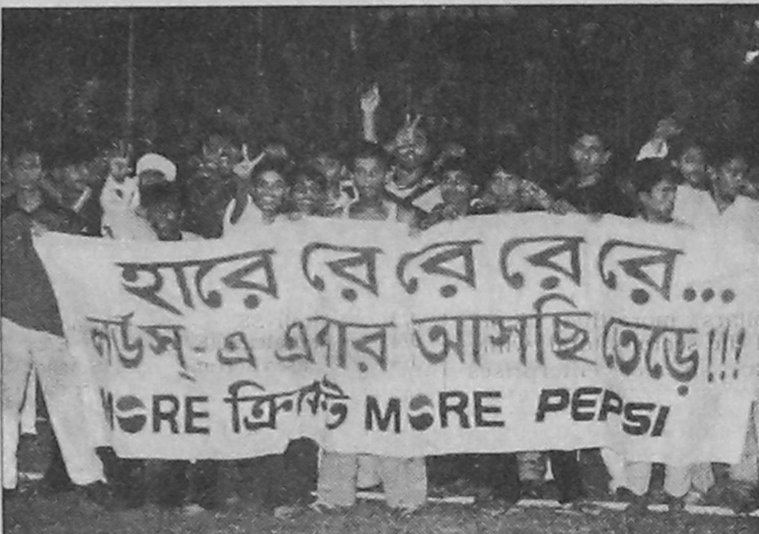
Crowd celebrating the Test Status at the concert