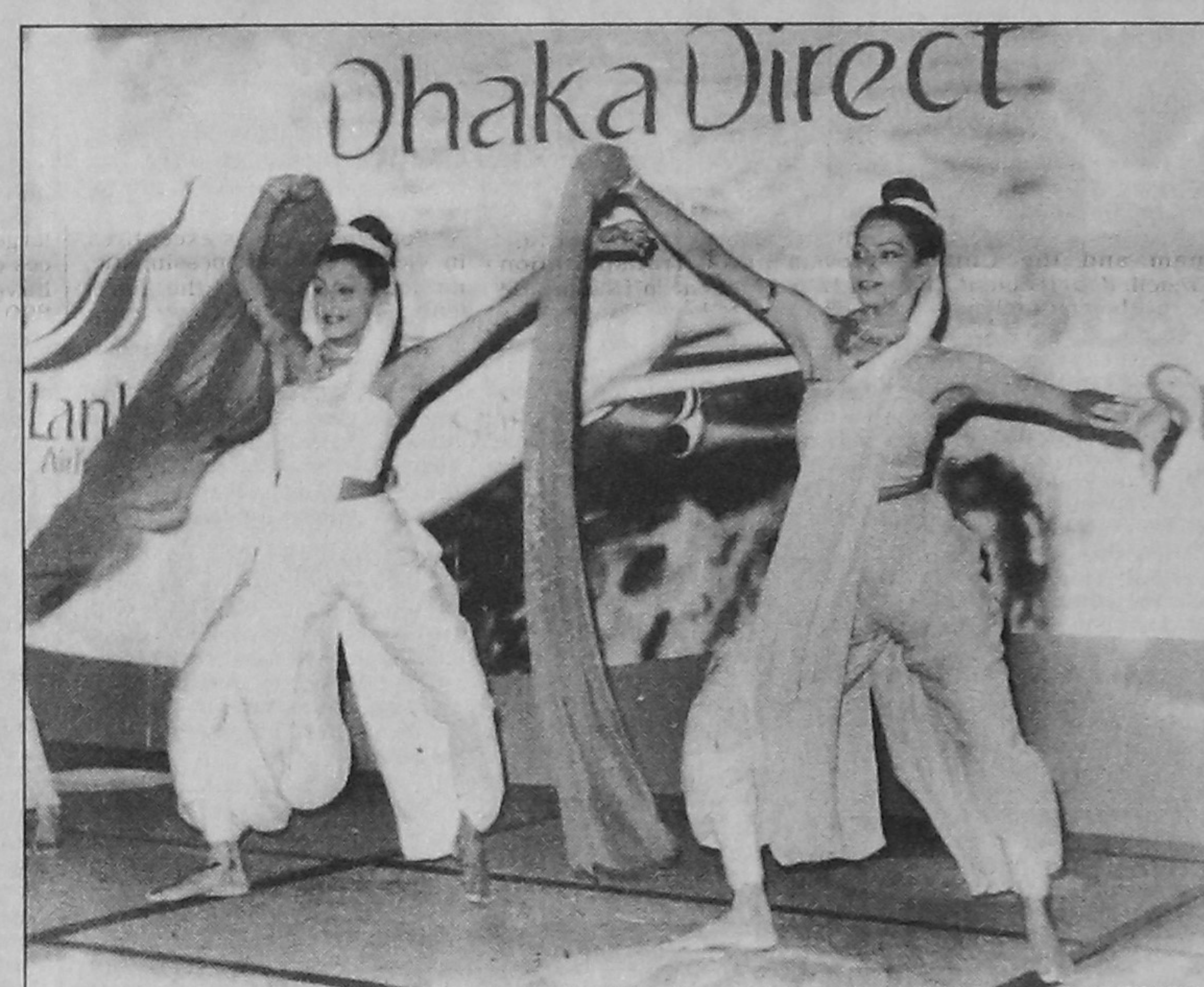
Sri Lankan ladies perform dance at a function at Hotel Sheraton yesterday marking the launching of Dhaka-Colombo direct flight.