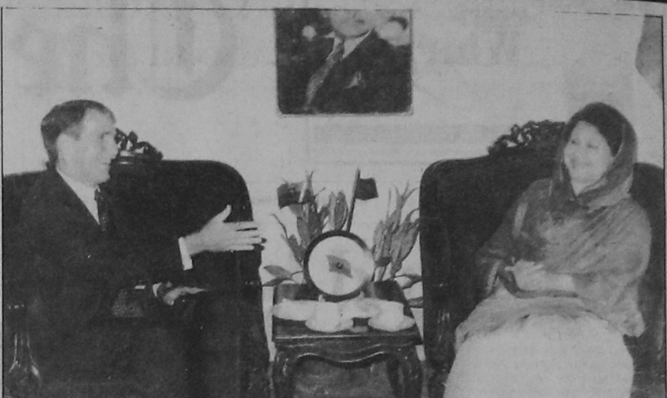
Outgoing US ambassador to Bangladesh John C Holzman called on Leader of Opposition in Parliament and BNP Chairperson Khaleeda Zia at her Minto Road official residence yesterday.