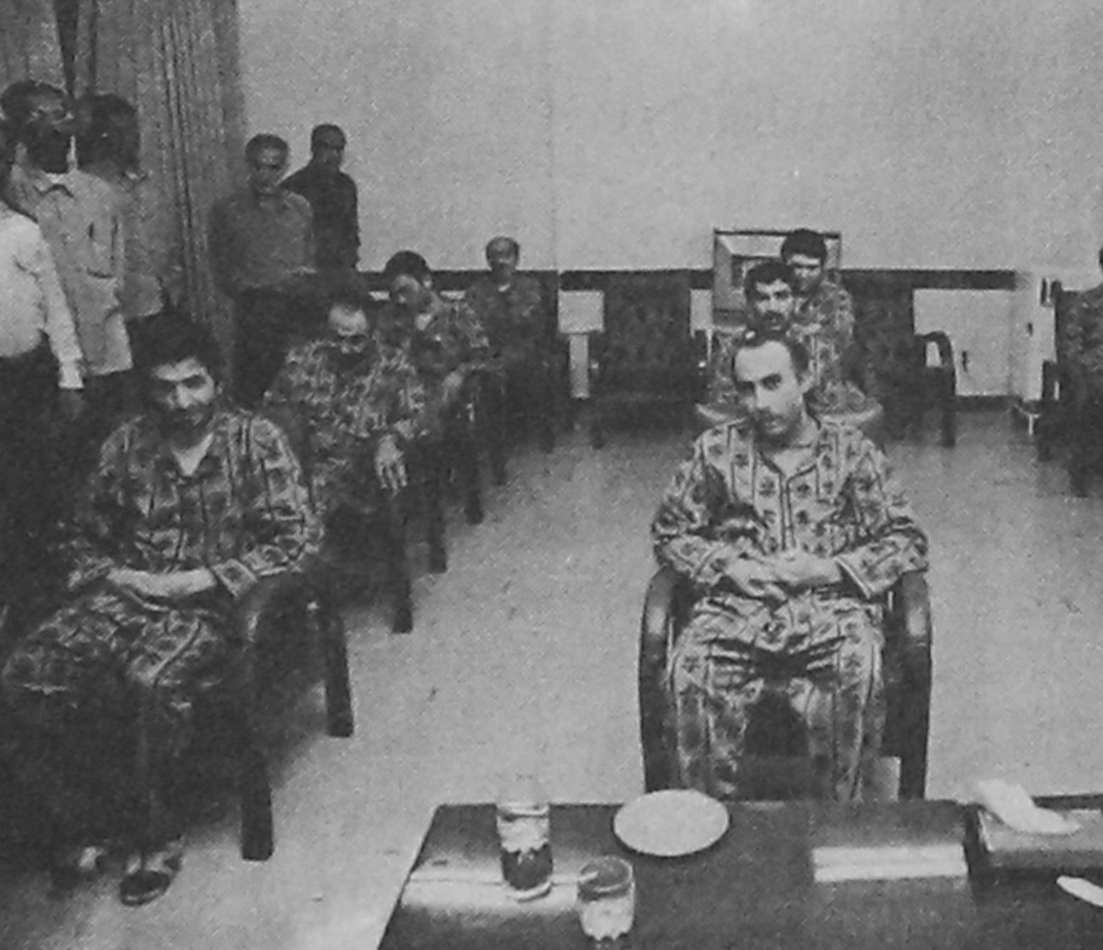
AFP file photo dated 29 May 2000 shows 10 Iranian Jews, convicted yesterday of spying for Israel, during the final hearing of their trial at the revolutionary court of Shiraz. Ten out of 13 Iranian Jews, as well as two Muslims, were given jail sentences totalling up to 13 years, while the remaining three Jews were acquitted.