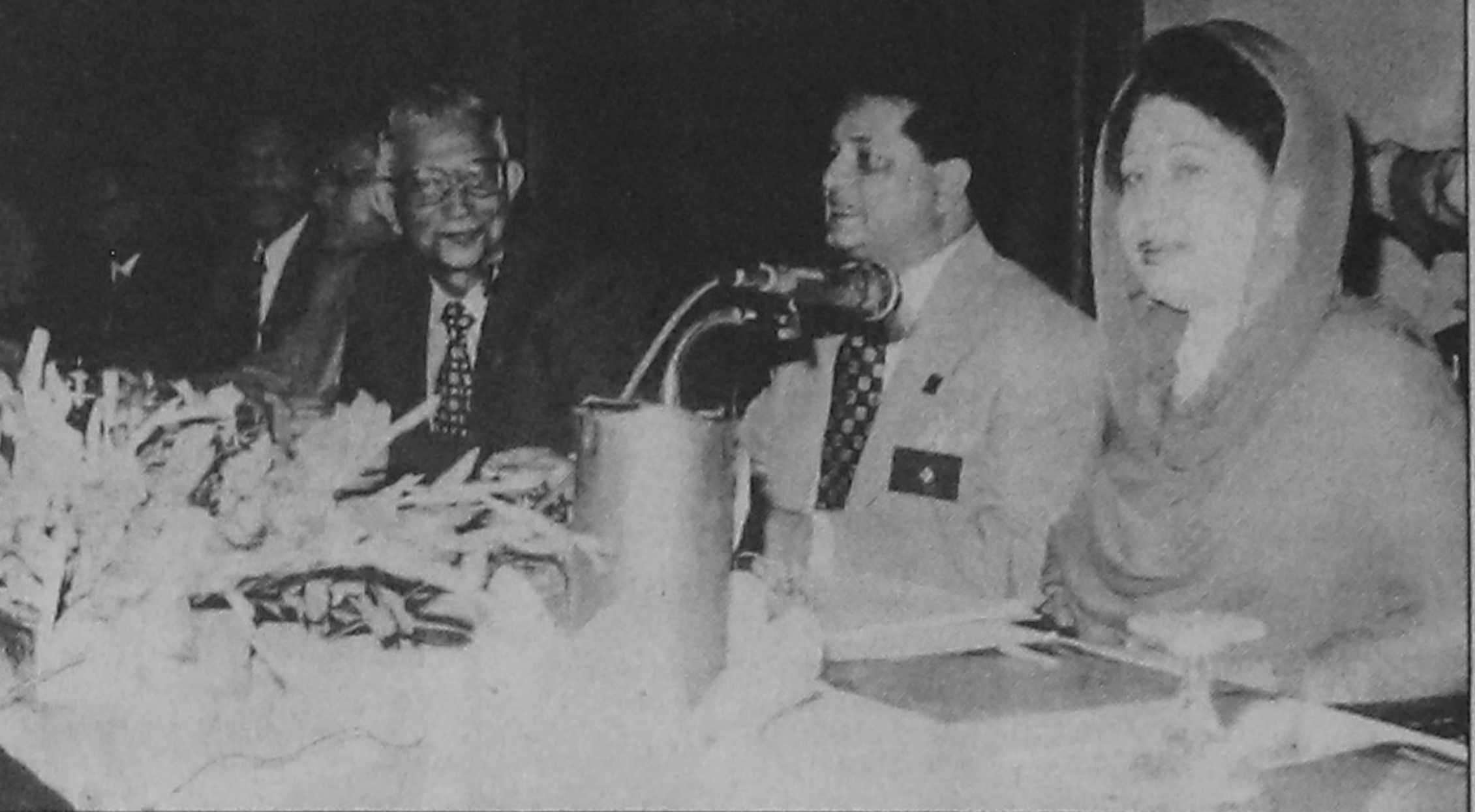
Opposition leader Khaleda Zia addressing an inter-city meeting on 'Environment and Literacy' organised by Rotary International at Sonargaon Hotel in the city yesterday.