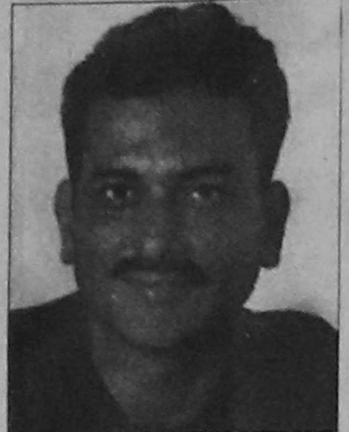
Ravi Shashtri (Former India cricketer) (Former India cricketer) (Former India cricketer) The best bowlers he has faced.