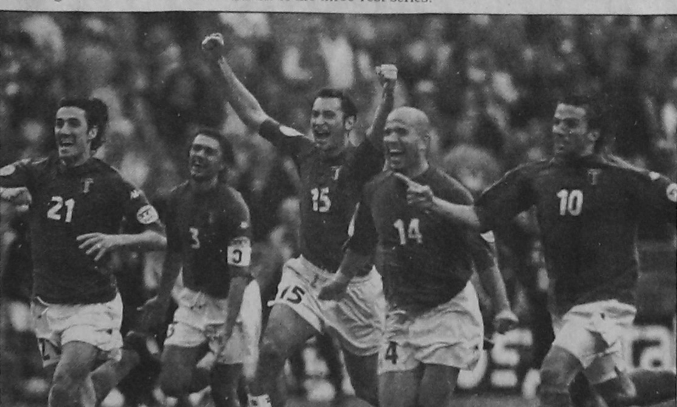
WE ARE IN THE FINAL! Ecstatic Italian players (L-R) Mario Delvecchio, Paolo Maldini, Mark Iuliano, Luigi Di Biaggio and Alessandro Del Piero rushing towards goalkeeper Francesco Toldo (Not

The team arrive are due to arrive in Sri Lanka on Saturday.