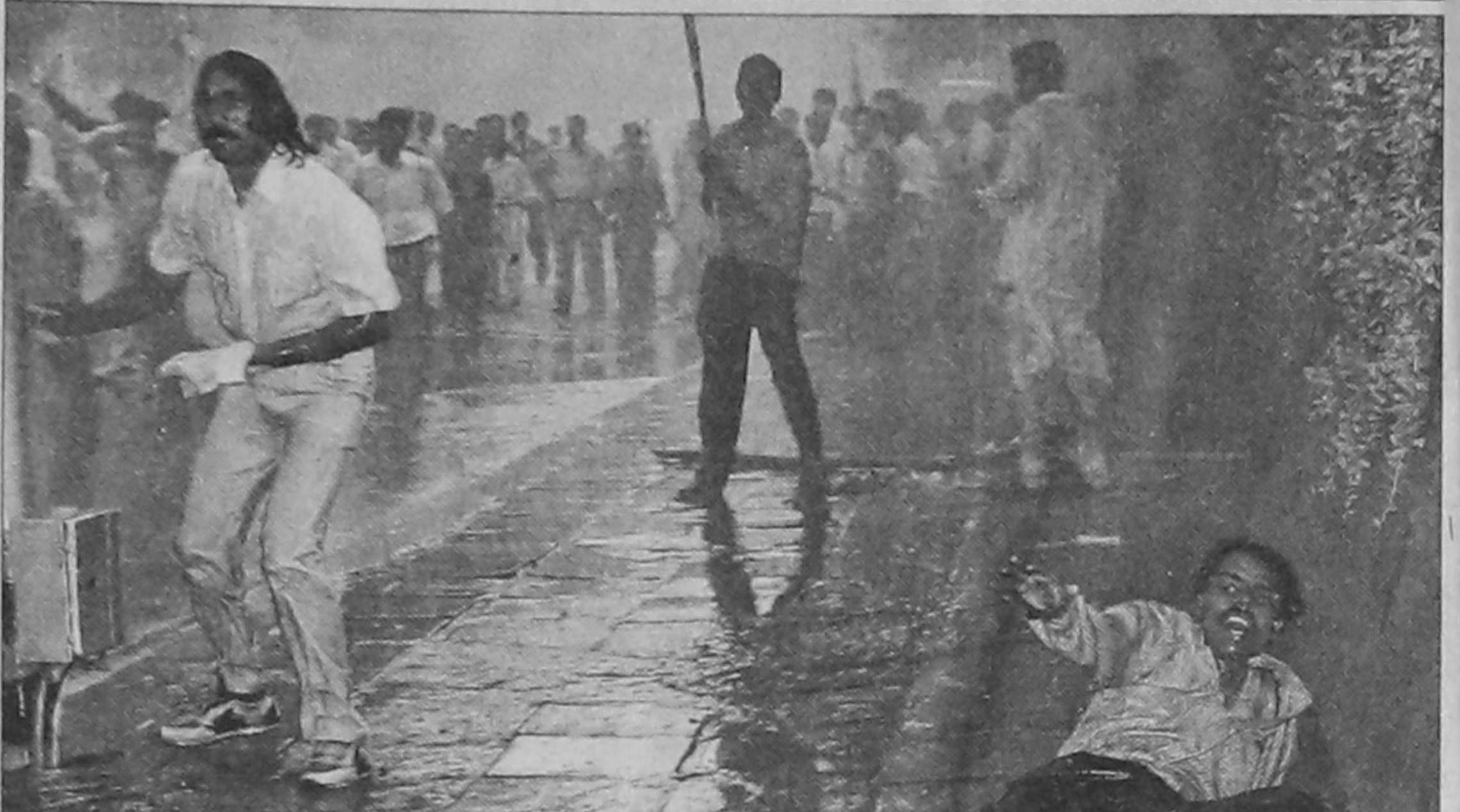
Youth Congress activists are hit with police water cannon as they attempt to break through police barricades during a protest against Prime Minister Atal Behari Vajpayee's BJP government near the parliament in New Delhi yesterday. The demonstrators demanded that the pro-BJP Hindu militant organisations RSS and Bajrang Dal be banned, as the Congress Party had blamed these organisations for the recent attacks on Christians and churches in India.

KABUL, June 30: The ruling Taliban freed 46 prisoners from a jail in western Afghanistan, calling the release a "good will" offering to their enemies, the state-run radio reported Friday, says AP.