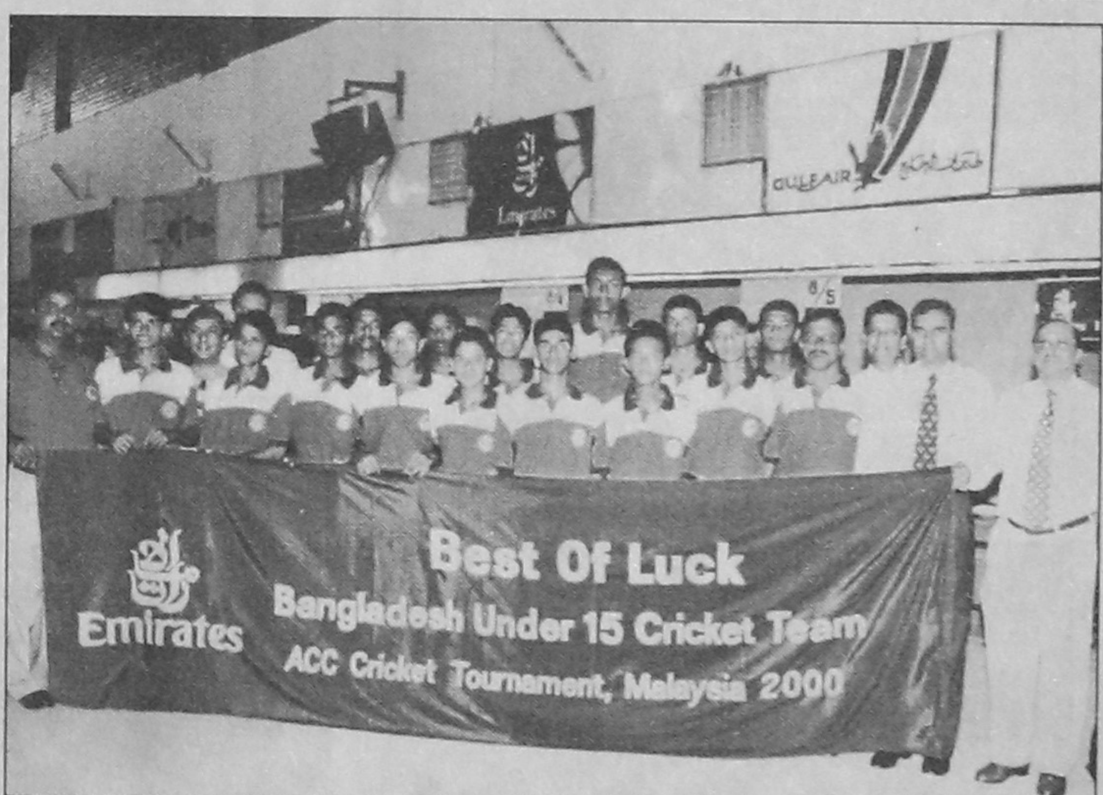
Members of the under-15 cricket team pose for a photograph at the Zia International Airport just before their departure for Malaysia yesterday. The team will take part in the June 30-July 9 ACC Tournament in Kuala Lumpur.

"In my first few matches I don't want to stay out there too long," Serena said. In the first round she had allowed Asa Carlsson of Sweden just five games.