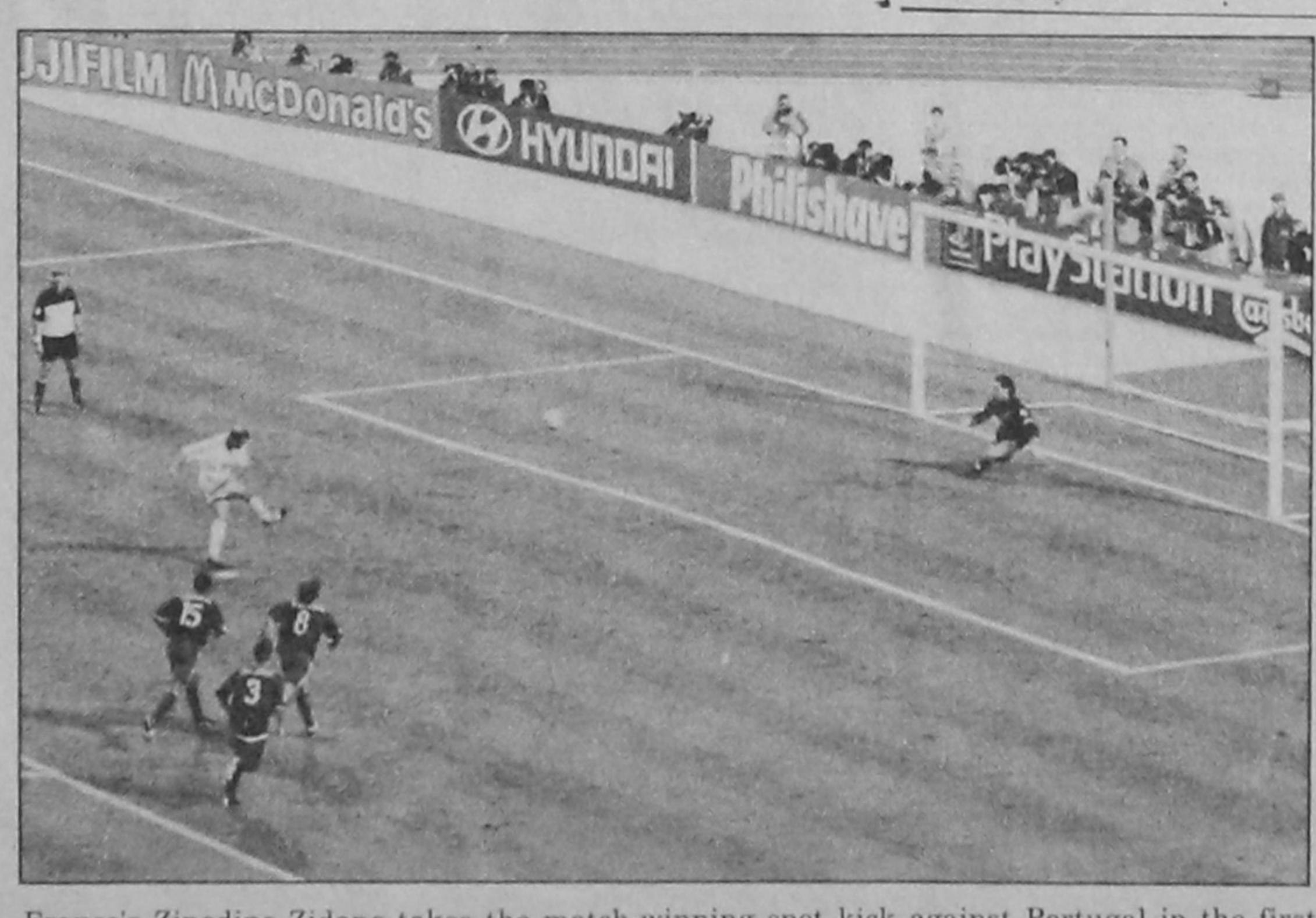
France's Zinedine Zidane takes the match-winning spot kick against Portugal in the first semifinal of the Euro 2000 in Brussels on June 28.

Umpires: J. Hampshire (England), S. Venkatraghavan (India).