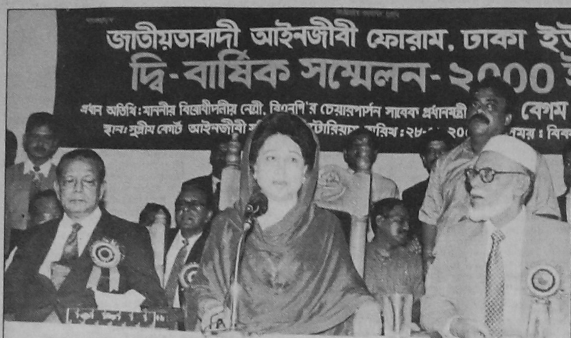
BNP Chairperson Khaleda Zia addressing the biennial conference of Jatiyatabadi Ainjibi Forum's Dhaka Unit at SC Bar auditorium yesterday.

TRANSCOM ELECTRONICS LTD. Authorized Distributor in Bangladesh for Whirlpool Appliances, USA Dhaka: 8115307-10 CTG: 716353, 725718 Khulna: 729394 Bogra: 6215