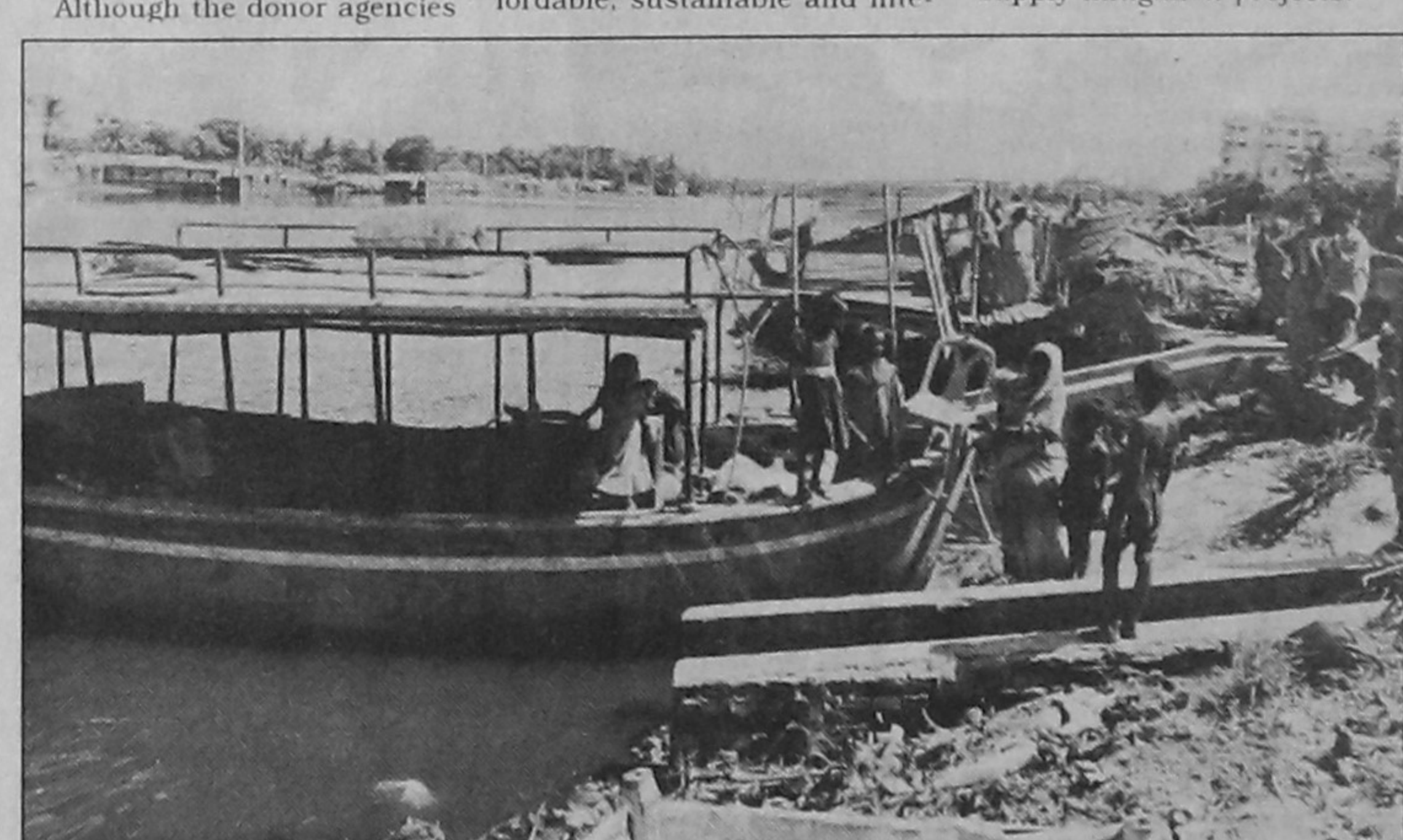
A family that encroached on public land along the Gulshan lake put their belongings on a boat prior to clearing out yesterday.

Some other mitigation projects, which are almost identical to the DFID project, are in their implementation stage funded by the World Bank and Unicef. The projects are Bangladesh Arsenic Mitigation Water Supply Projects and Action Research Water Supply Project. Both the projects involve community-based affordable and sustainable water supply mitigation projects.